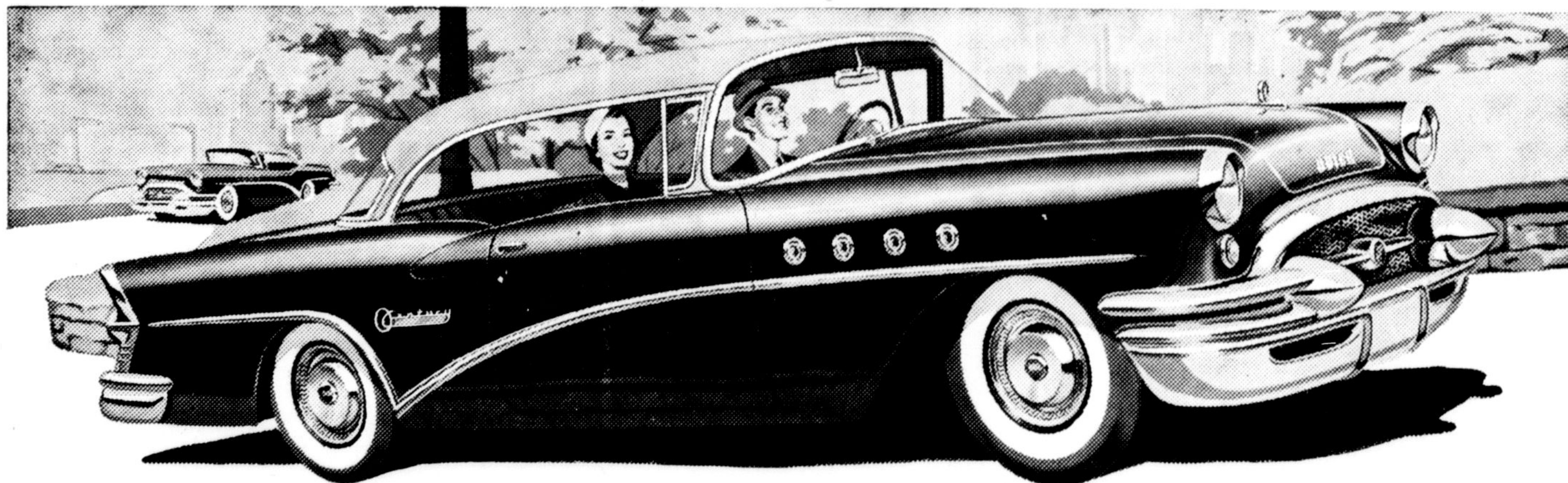
A GENERAL MOTORS VALUE