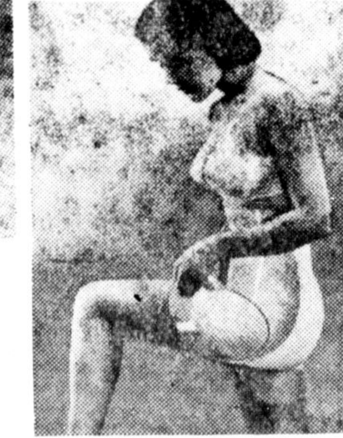
New! half-moon sections assure leg-free action

give yourself the joy of a new, young figure!