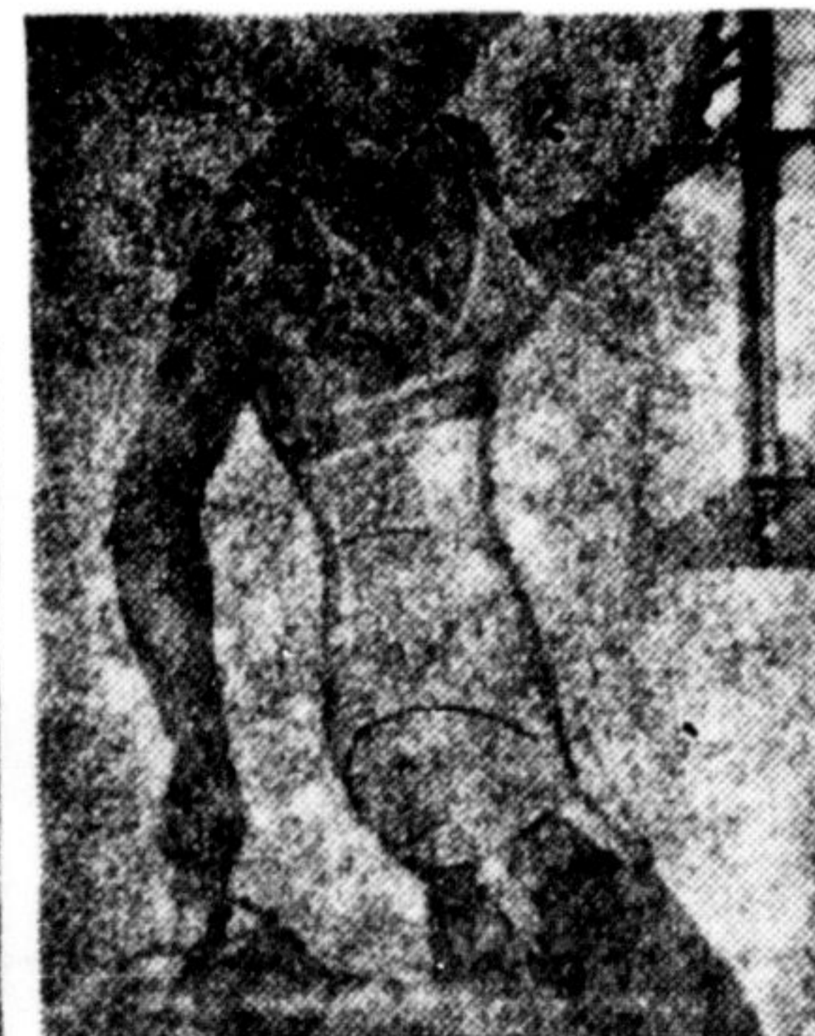
New! horizontal stretch above waist breathes with you