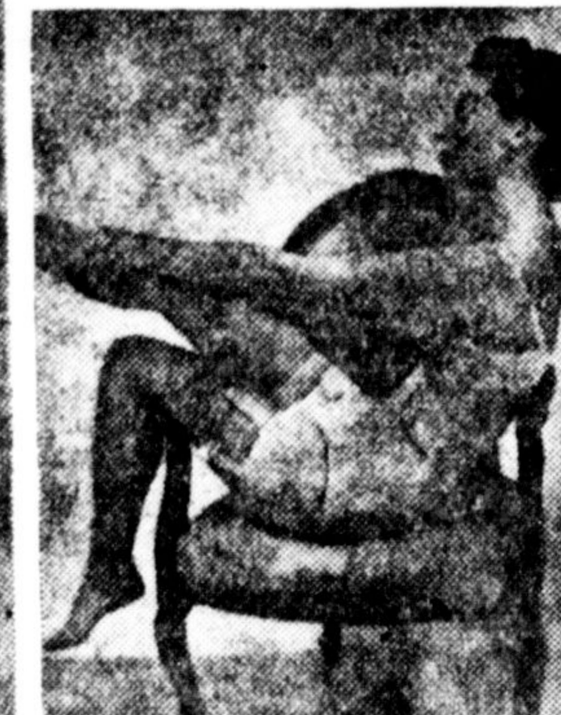
New! diagonal side panels lift and slenderize the figure