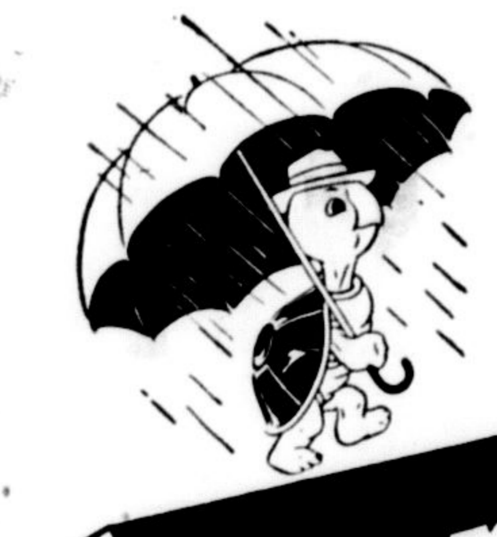
"It's the covering that counts"

It takes more than a heavy wind to affect the Brantford Super-Tite Slates on any roof. In fact, we don't know of a single instance where a Super-Tite slate, properly applied, has blown off.