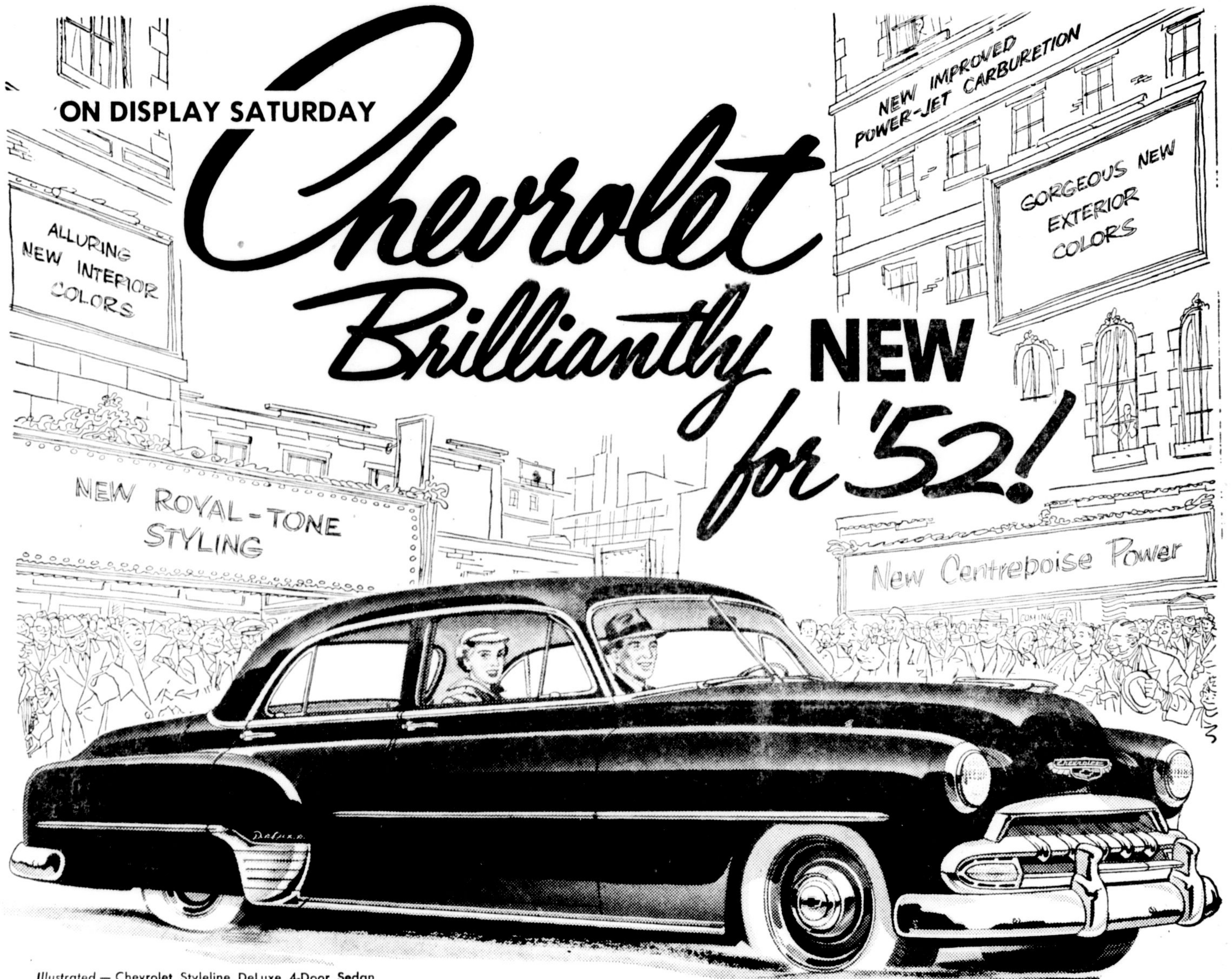
Illustrated — Chevrolet Styleline DeLuxe 4-Door Sedan

FRESH DAILY—Green Beans, Salads, Spinach, CELERY, GRAPES, BANANAS