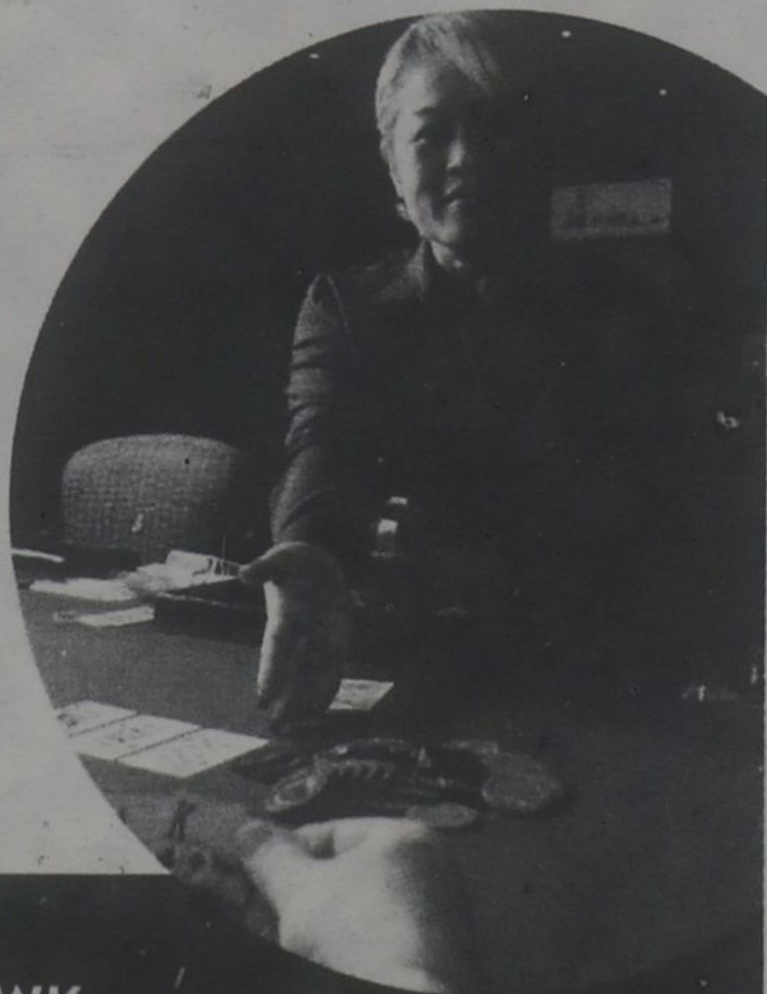
TABLE GAMES DEALERS • COOKS • SERVERS HOSTS • DISHWASHERS • HOUSEKEEPERS

APPLY IN PERSON AT ELEMENTS CASINO MOHAWK