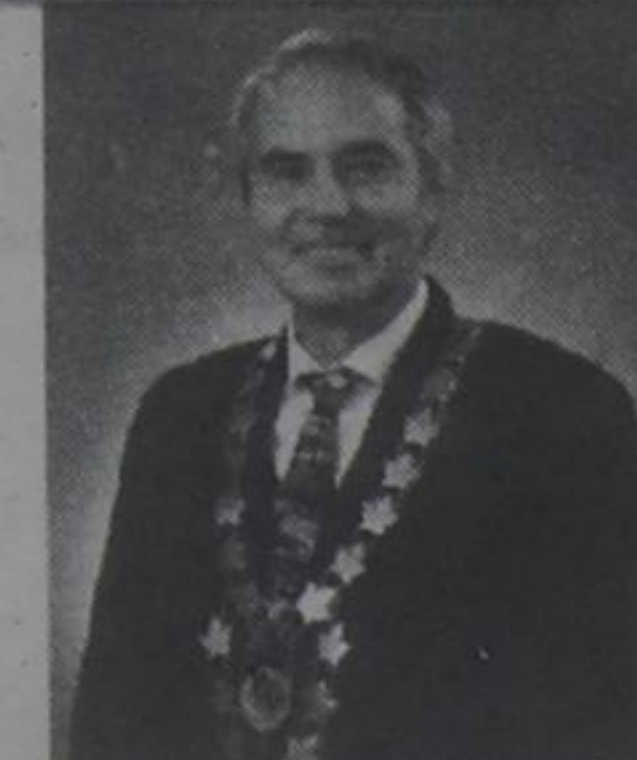
Gary Carr Regional Chair

Being prepared can help protect yourself, your family and your home from the impacts of severe weather and other emergencies. Heavy snowfall, freezing rain, power outages and extreme cold are common in southern Ontario and you can ensure you are ready for winter by following three easy steps: know the risks, make a plan and get a kit. We all have a role to play—for information to help you prepare, including tips for residents of high-rise buildings and evacuation centre locations, please visit halton.ca .