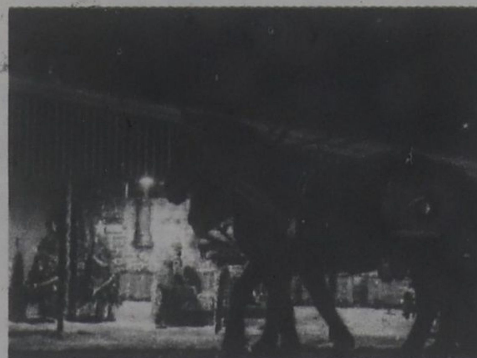
Woodbine Mohawk Park's holiday events run throughout December.

This year's event will feature holiday dining throughout the month of December, as well as a holiday cocktail workshop for adults on Friday, Dec. 6 — part of WMP's beverage-tasting series in November and December. And on Dec. 14 and 21, WMP will offer up a full roster of holiday-