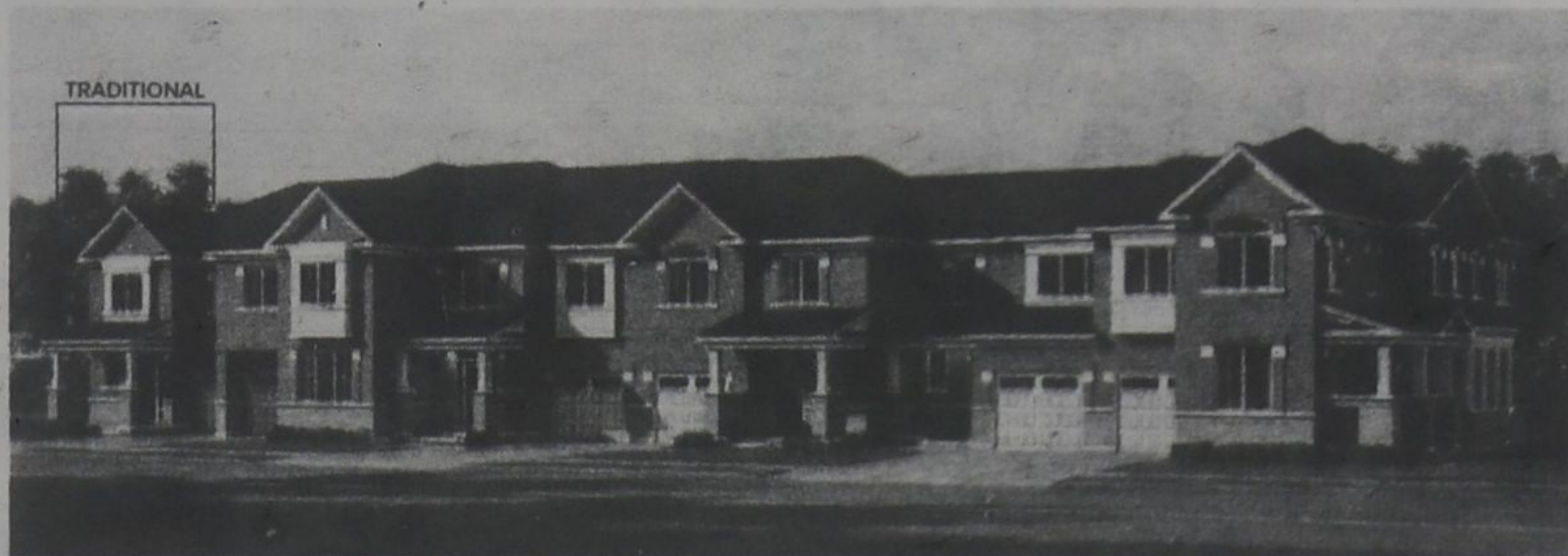
2-Storey Town, The Garrison End 'Traditional', 1,692 sq.ft.

Life is good in Hawthorne South Village Sixteen Mile Creek.