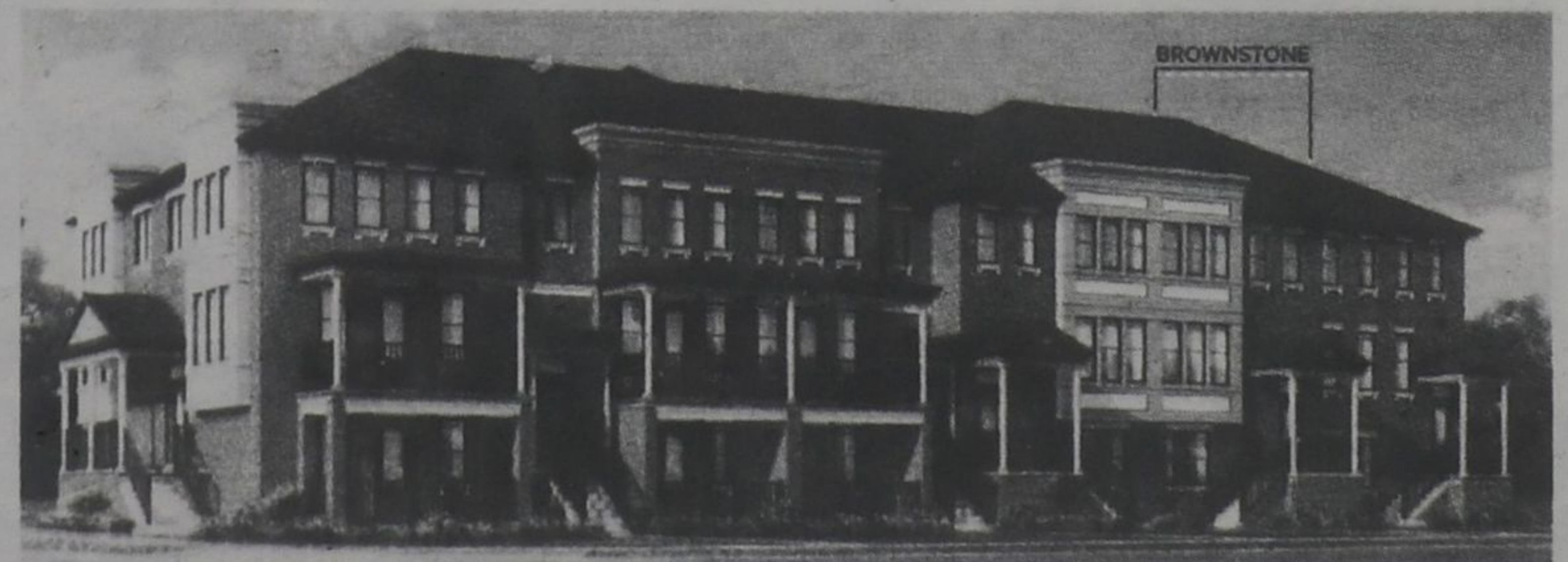
Brownstone Town, The Hayes 'Brownstone', 1,888 sq.ft.