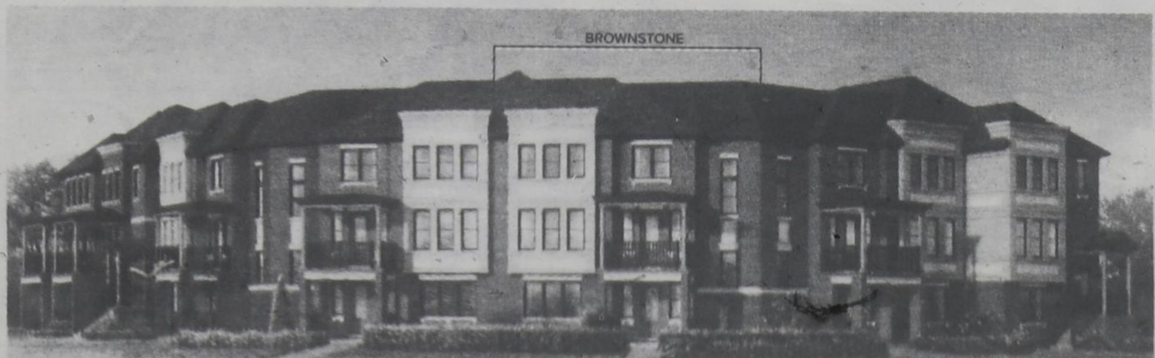
Brownstone Town, The Stafford 'Brownstone', 2,238 sq.ft.