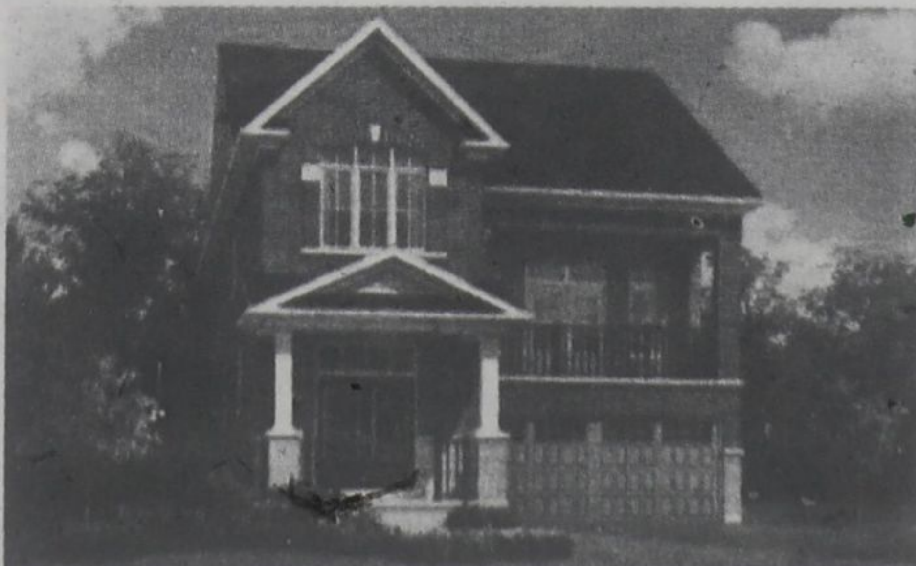
36' Detached Home, The Montrose 'Traditional', 2,365 sq.ft.

With a selection of Village Homes, Brownstone Towns, Two-Storey Towns & 30', 36', 43' (only one available) and 66' Detached Homes, there's something for everyone. Enjoy up to $20K in Design Studio incentives and free condo fees for one year on all Towns.