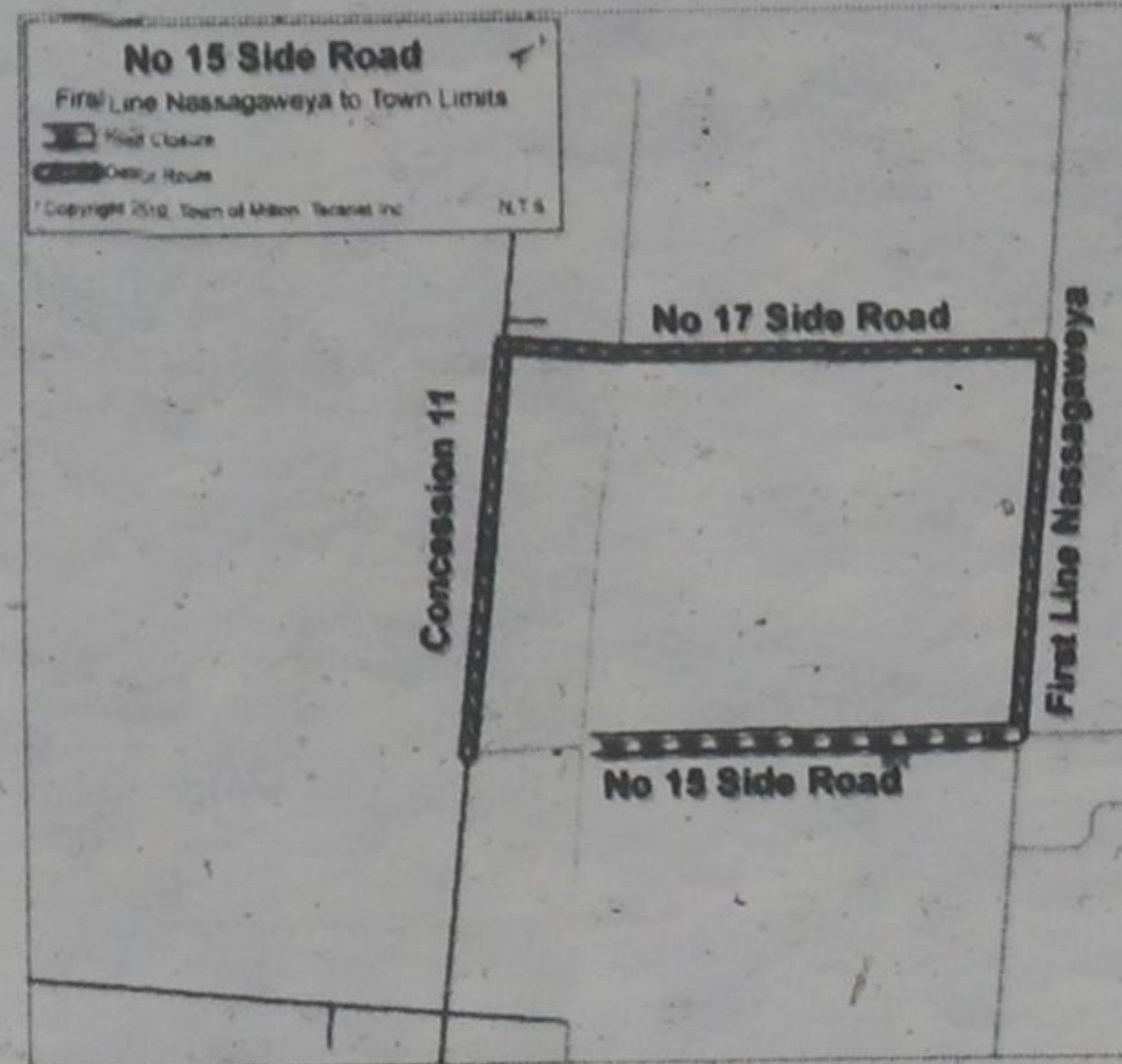
Town of Milton/graphic