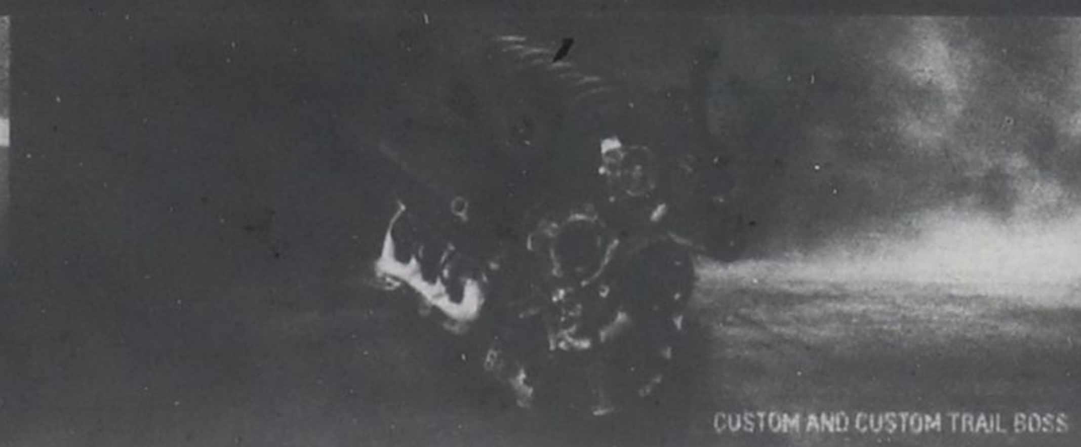
5.3L V8 ENGINE WITH 355 HP AND 383 LB-FT OF TORQUE