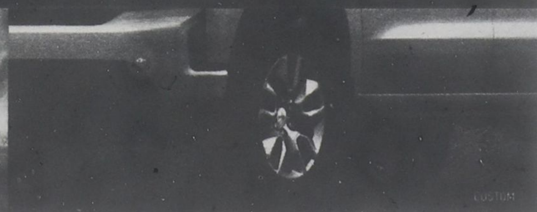
STANDARD 20-INCH BRIGHT ALUMINUM WHEELS