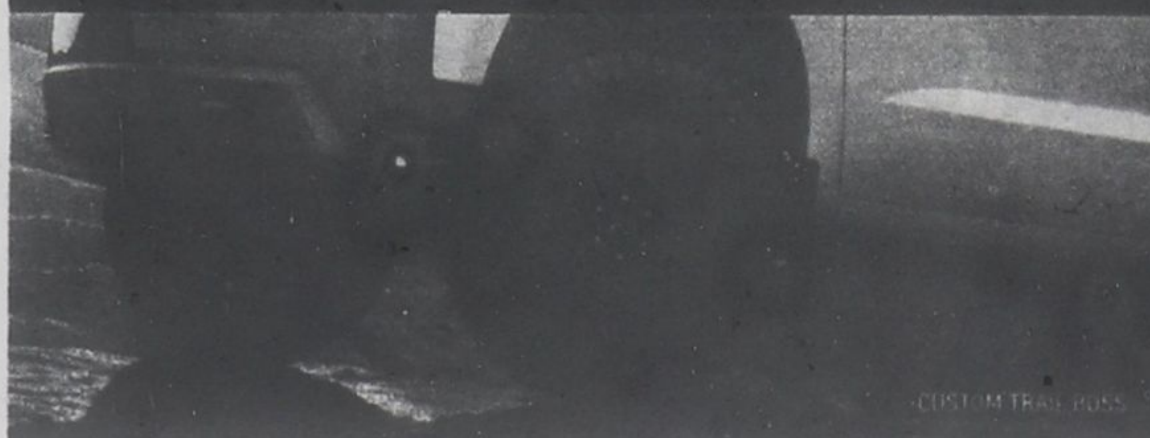
STANDARD 2" FACTORY SUSPENSION LIFT WITH Z71 OFF ROAD PACKAGE

LEASE EITHER FOR $199 BI-WEEKLY, THAT'S LIKE: $99 @ 3.9% WEEKLY LEASE RATE FOR 24 MONTHS WITH $4,325 DOWN PAYMENT