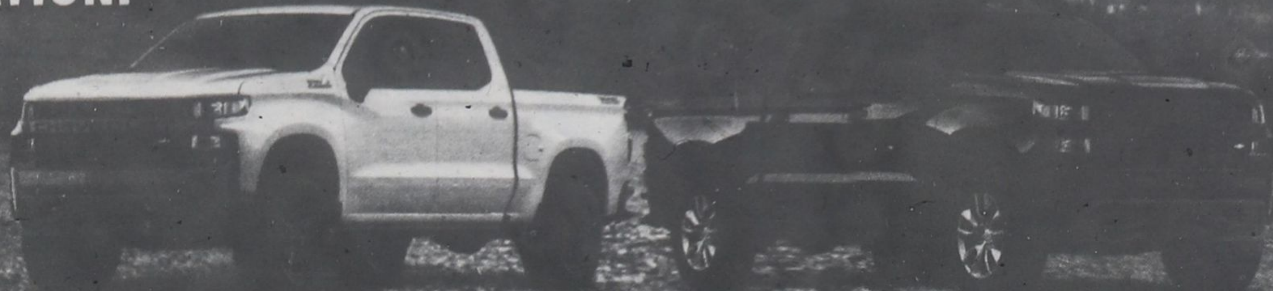
SILVERADO CREW CAB CUSTOM TRAIL BOSS