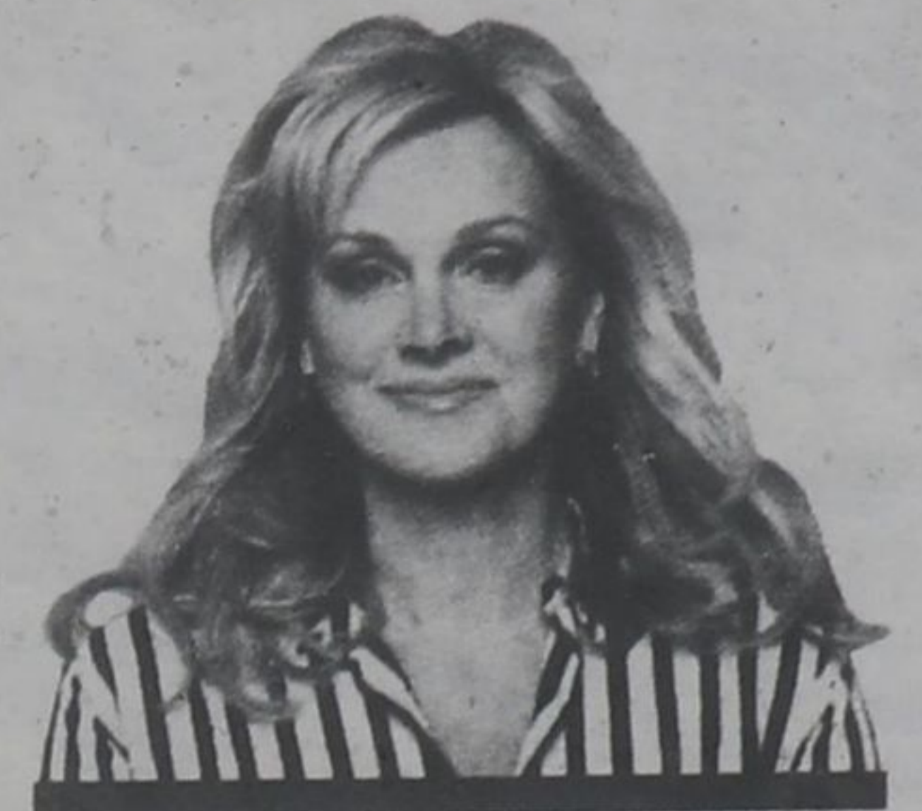
DEBBIE TRAVIS | House to Home

I found an old table at a country fair and knew it would make a perfect addition to a kitchen or patio. After giving the table a cleaning and light sanding, I revived the beautiful wood with an oak stain. Then, to add country charm I painted a white dishtowel over the dark wood. To make the painted cloth, mask off a diamond design on the tabletop. To add an authentic touch, have the points of the cloth hang over the table edge. Prime and paint the