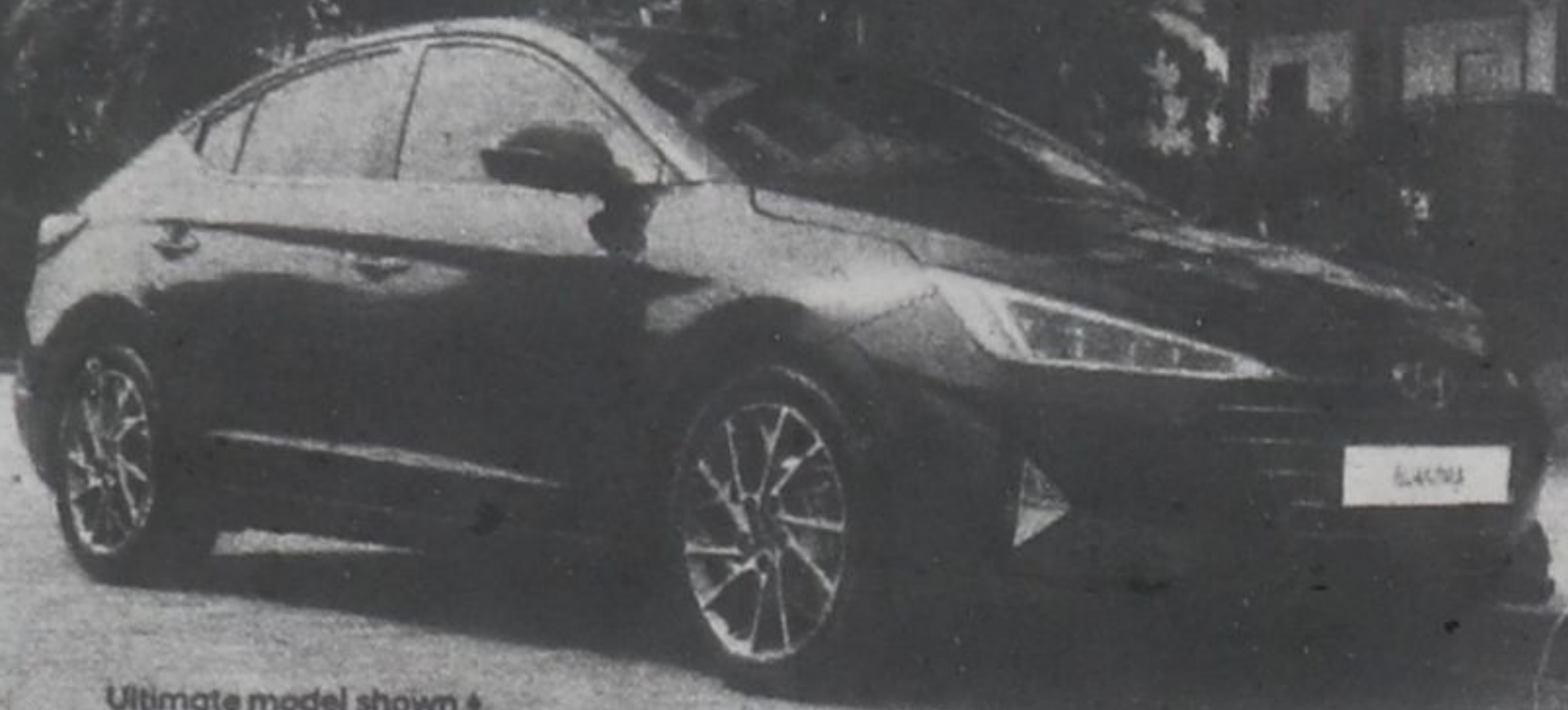
Ultimate model shown.