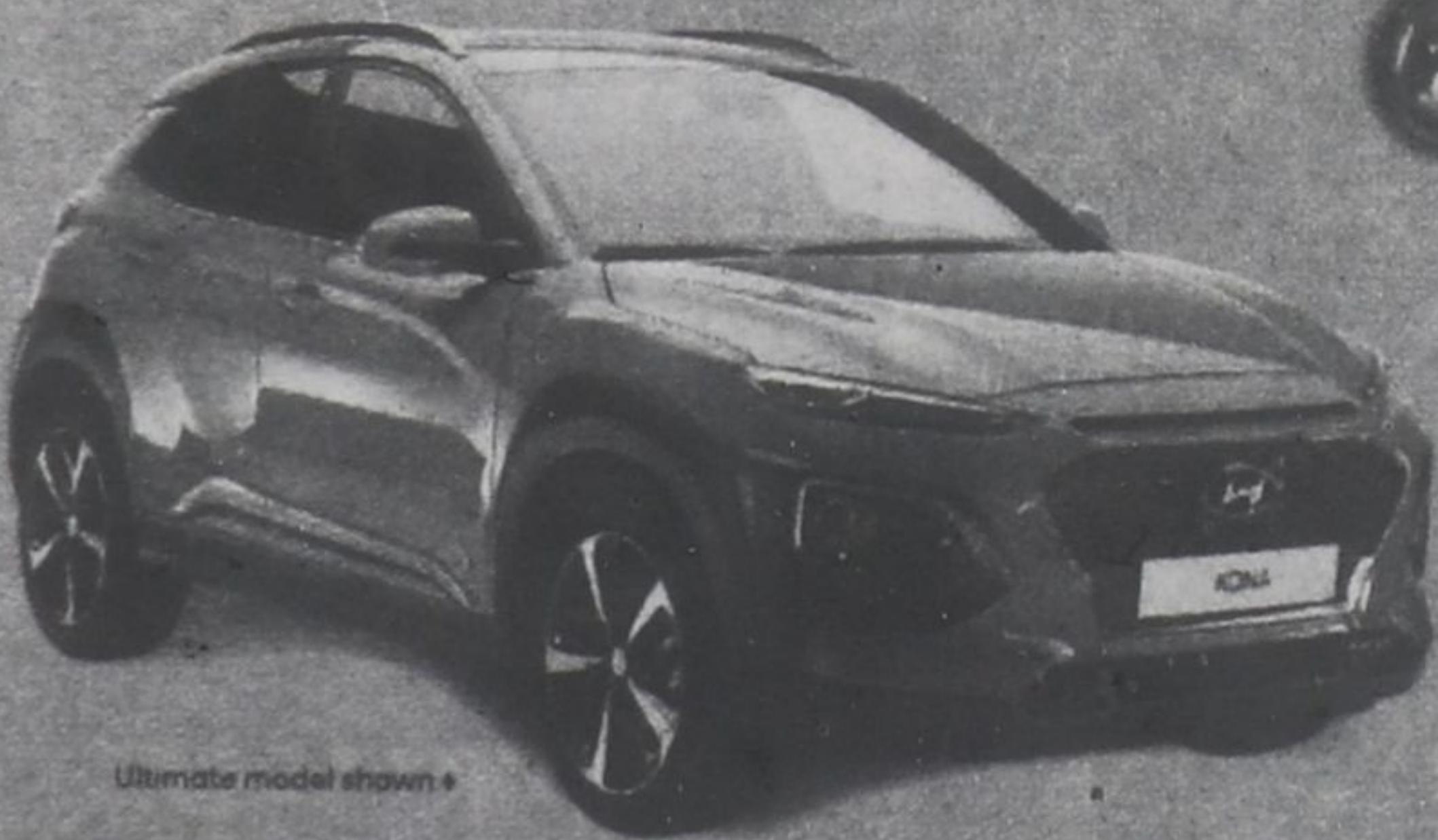
Ultimate model shown.

2019 North American Utility Vehicle of the Year**