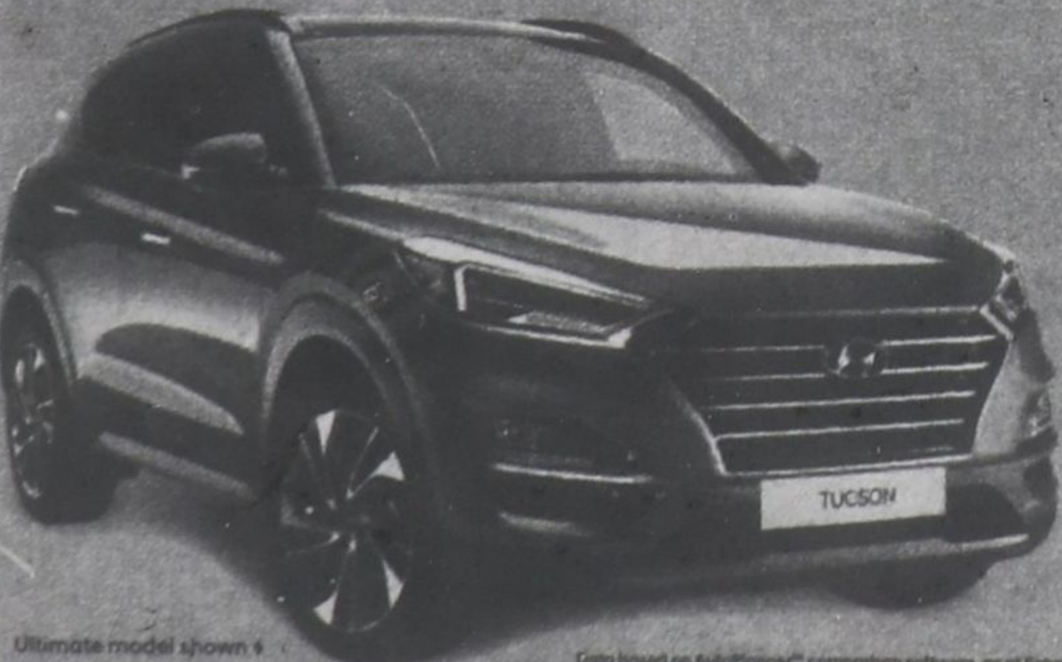
Ultimate model shown.