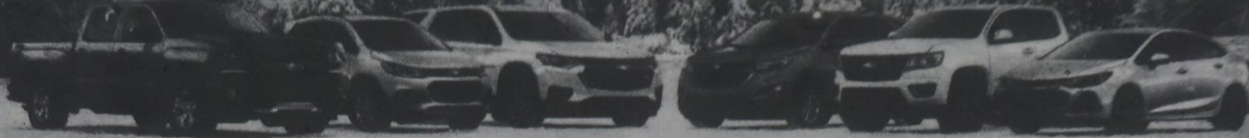
SILVERADO TRAX TRAVERSE EQUINOX COLORADO CRUZE