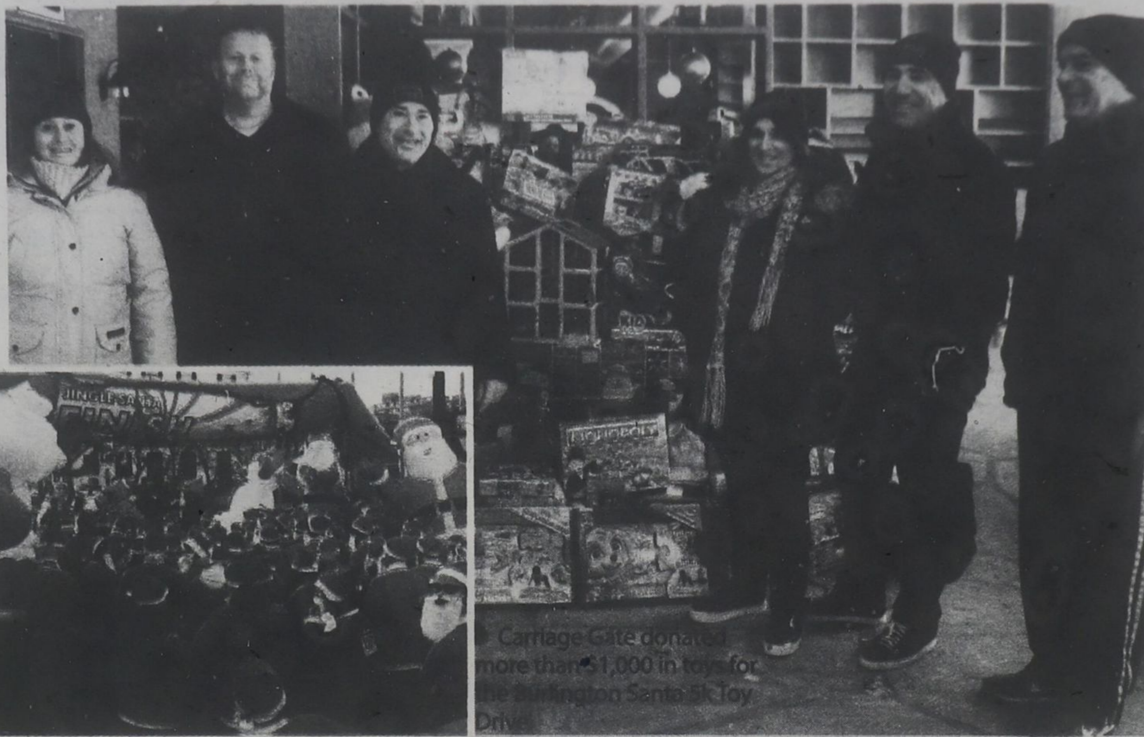
Carriage Gate donated more than $1,000 in toys for the Burlington Santa 5k Toy Drive.

To register and learn more about this new condominium planned in downtown Burlington visit gallerycondominiums.ca