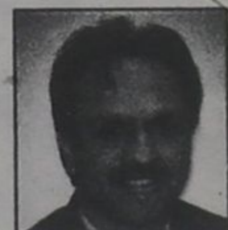
MAQBOOL SHEIKH Column

BUT 'WE' CAN CHANGE THAT, WRITES MAQBOOL SHEIKH