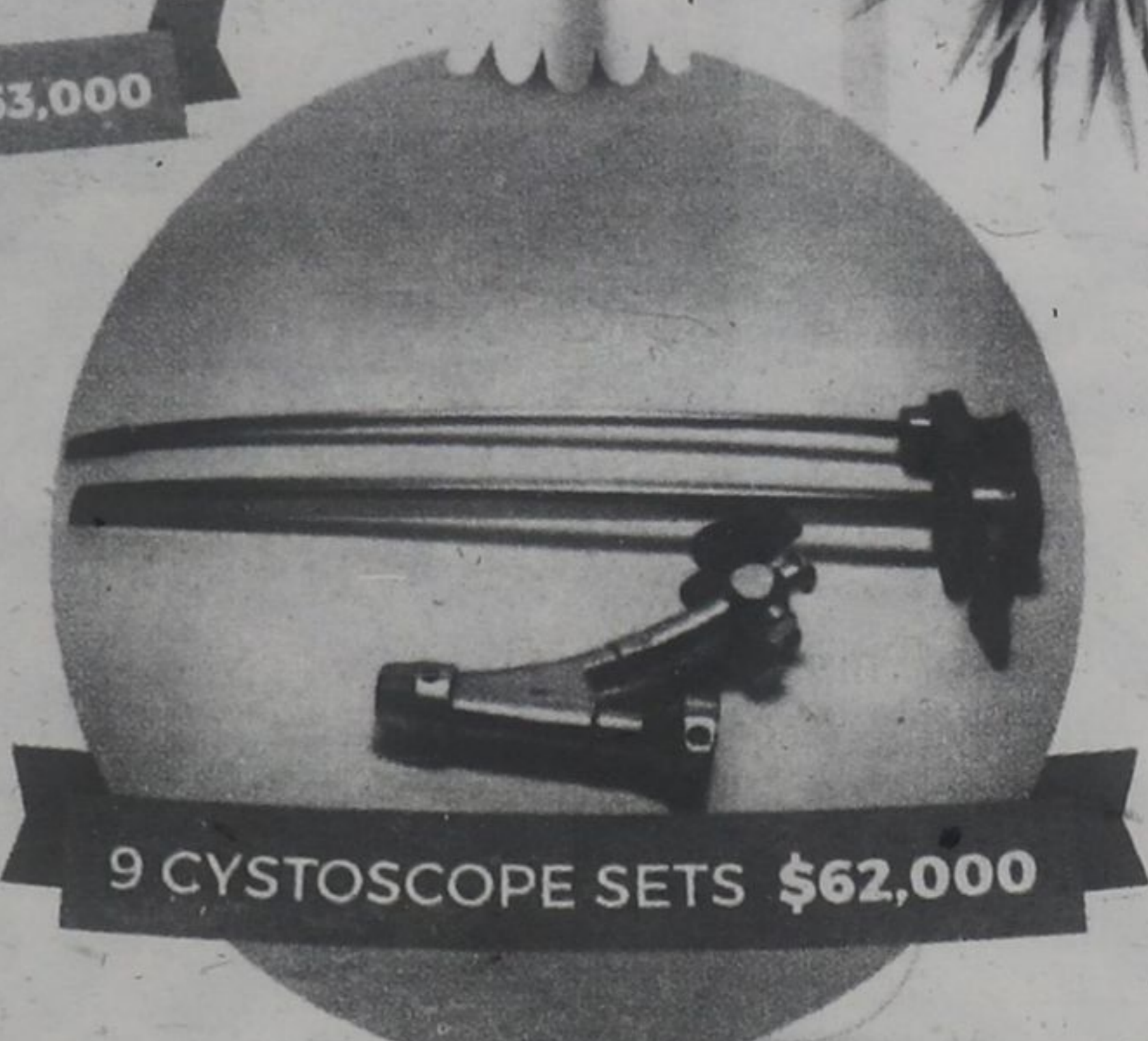
9 CYSTOSCOPE SETS $62,000