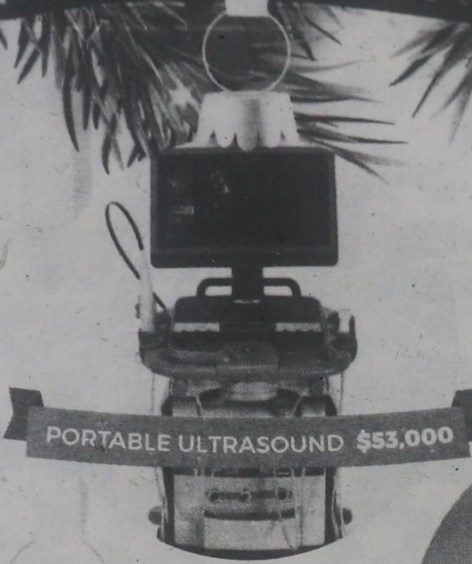
PORTABLE ULTRASOUND $53,000

We have a long list of equipment on our holiday list this year, this is just a few of them. It is only through the support of the Milton community that we can fund these priorities.