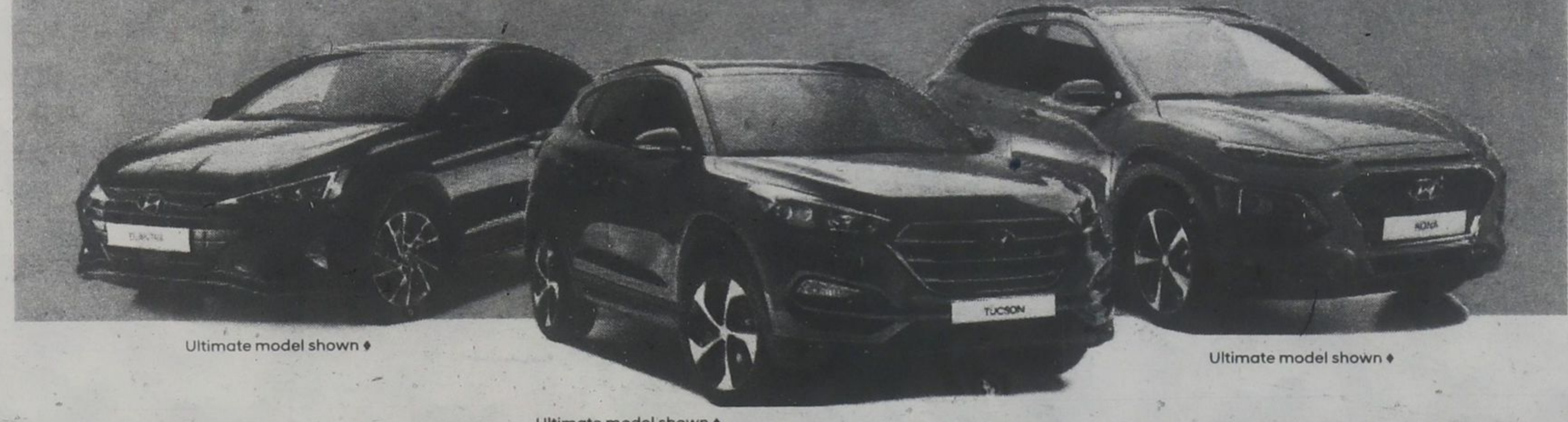
Ultimate model shown ♦

PLUS GET GREAT DEALS ON THE HEATED FEATURES YOU WANT