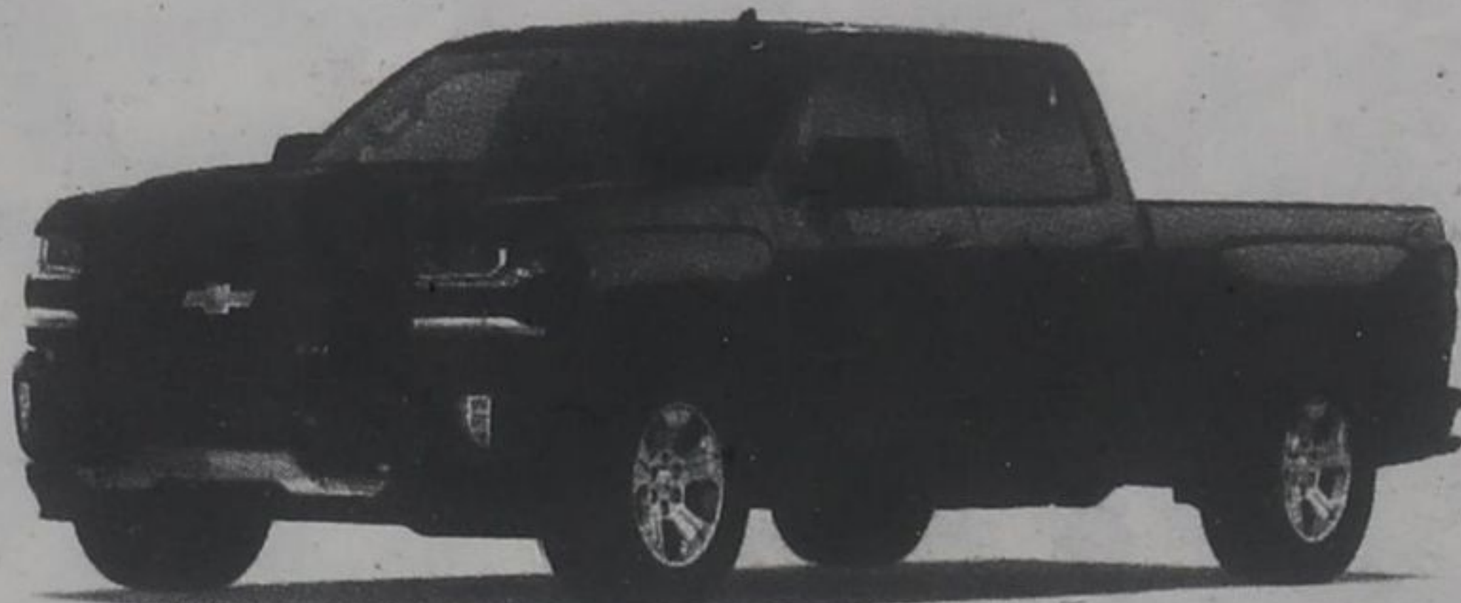
2LT CREW CAB MODEL SHOWN