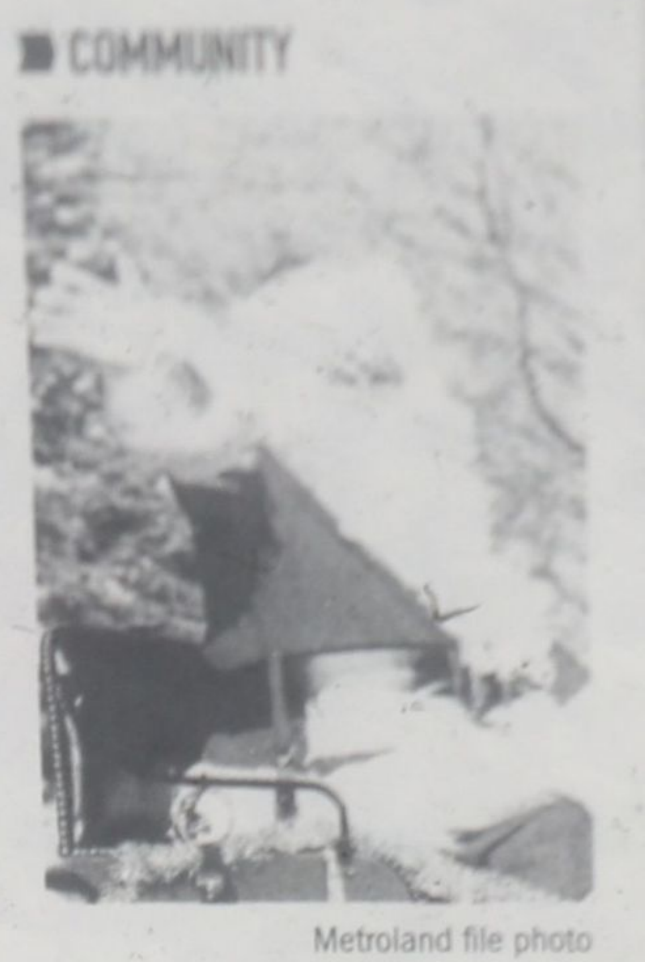
Santa Claus visits Milton this Sunday for his annual parade.