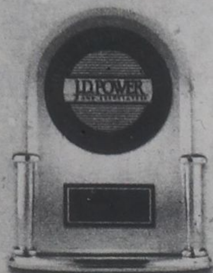
2018 Sorento "Highest Ranked Midsize SUV in Initial Quality in the U.S., 2 Years in a Row"

+ NO-CHARGE MAINTENANCE ON SELECT MODELS