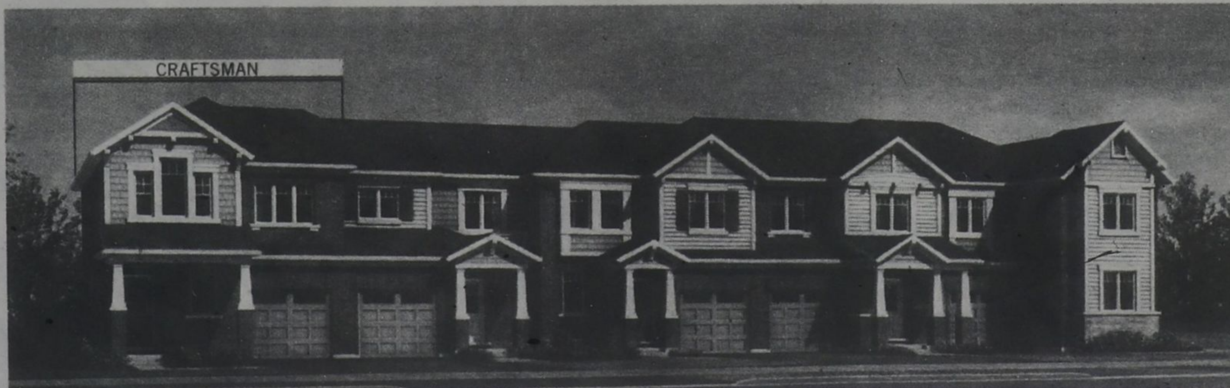
2-Storey Townhome, The MacFarlane End 'Craftsman', 1,732 Sq.Ft.

Visit us today to learn about our incentives.