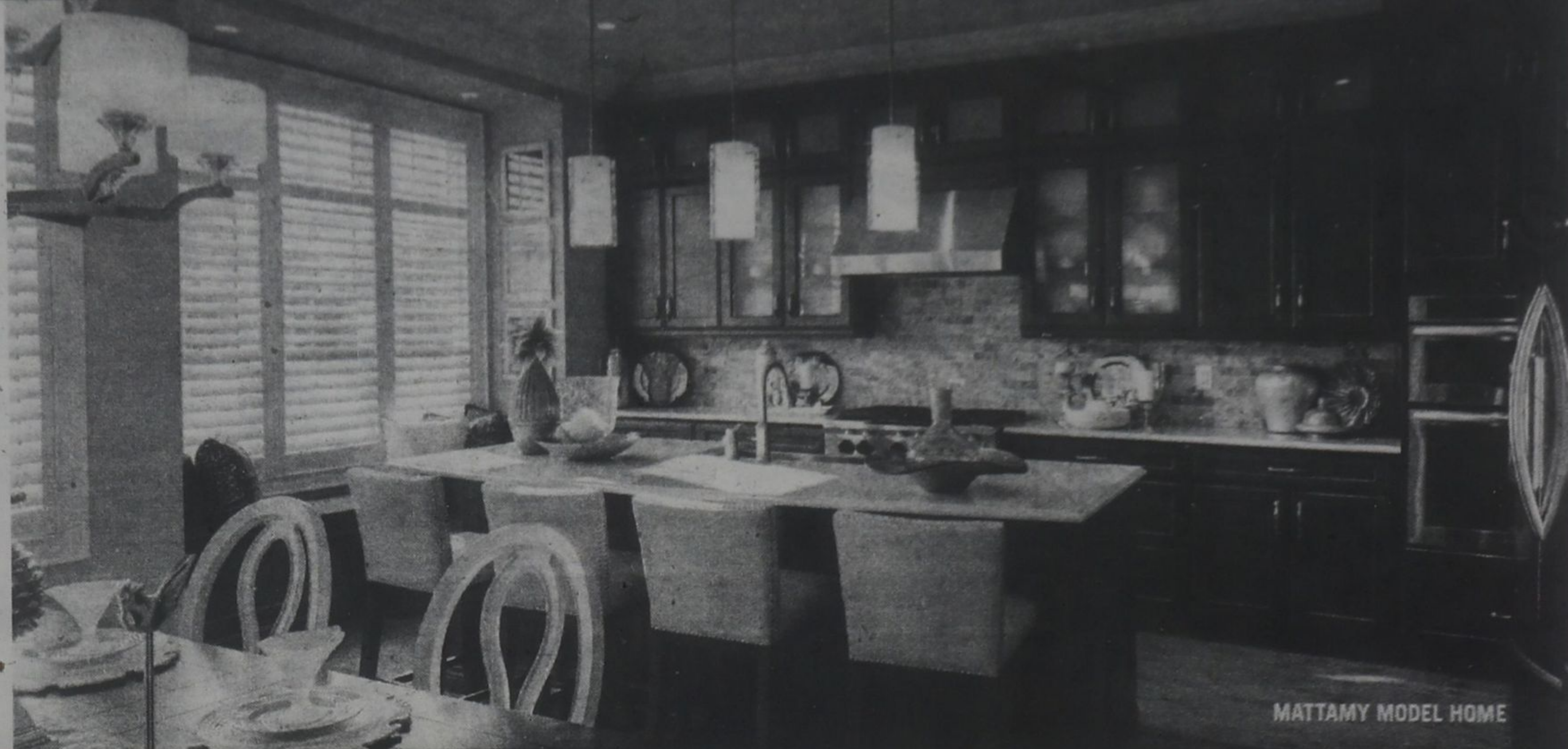
MATTAMY MODEL HOME