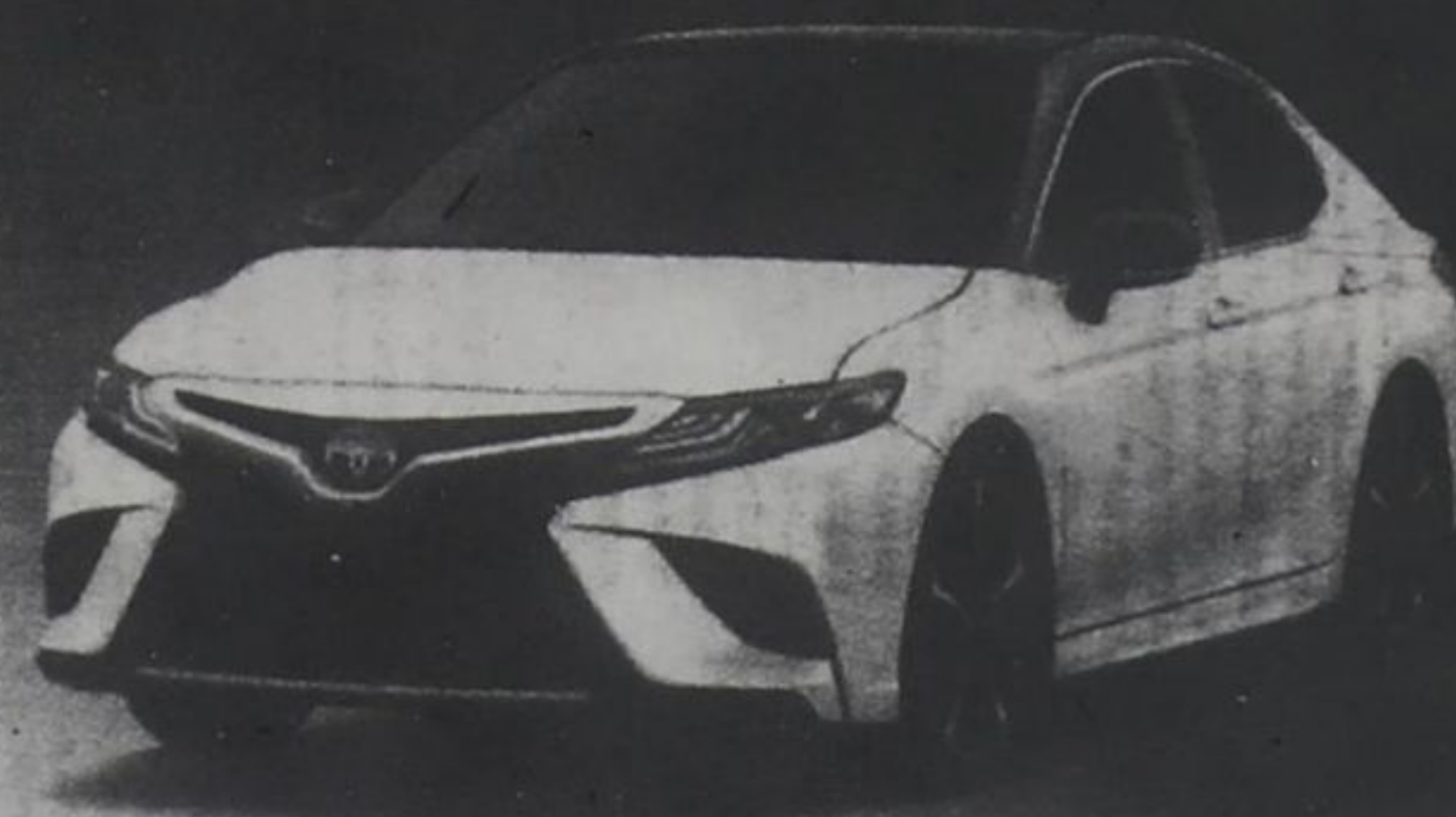
XSE V6 model shown. 2018 CAMRY

Weekly for 39 months with $1,000 Lease Assist* applied. Includes freight and fees. HST extra.