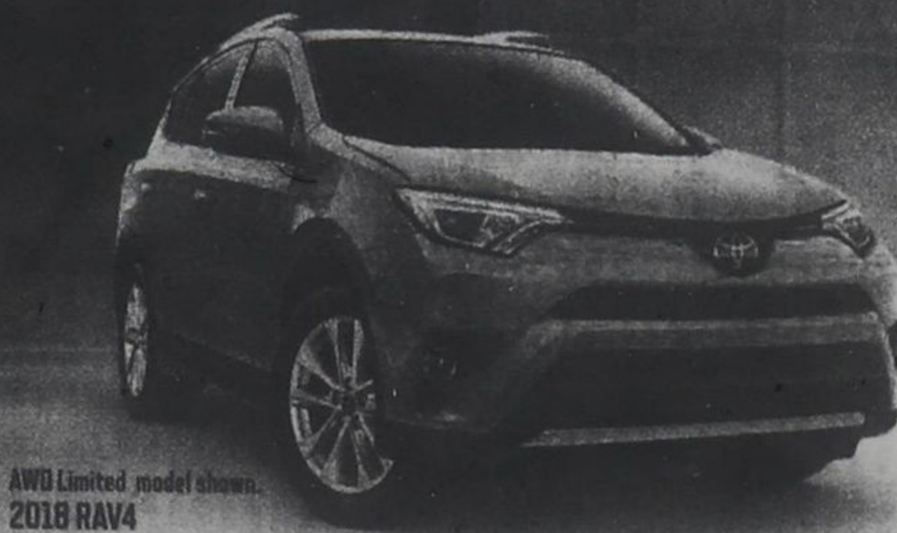
AWD Limited model shown. 2018 RAV4