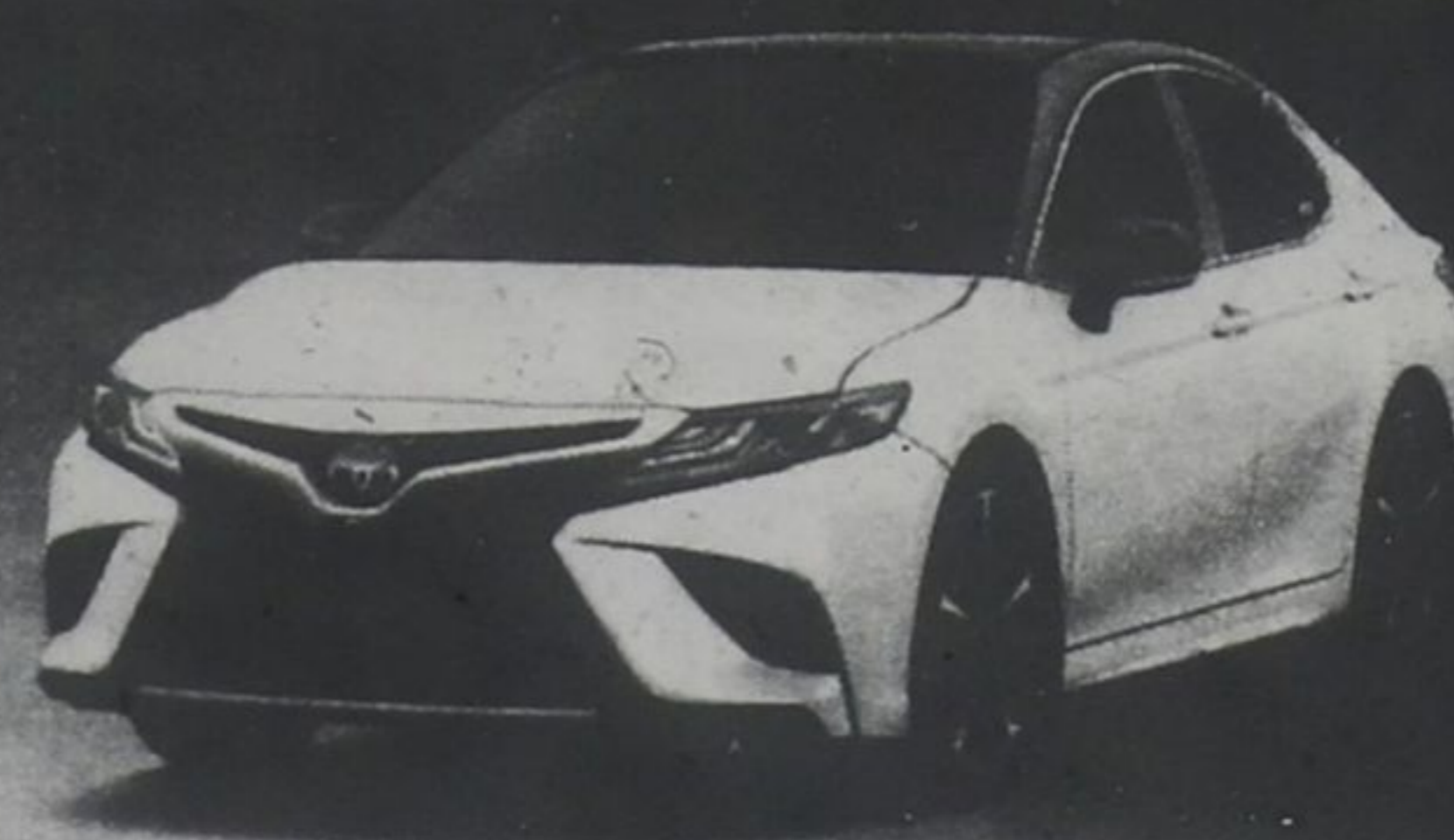
XSE V6 model shown. 2018 CAMRY

ALL THAT AND MORE ALL-IN LEASE $90 † or 1.49% APR | $0 DOWN PAYMENT Weekly for 39 months with $1,000 Lease Assist* applied. Includes freight and fees. HST extra.