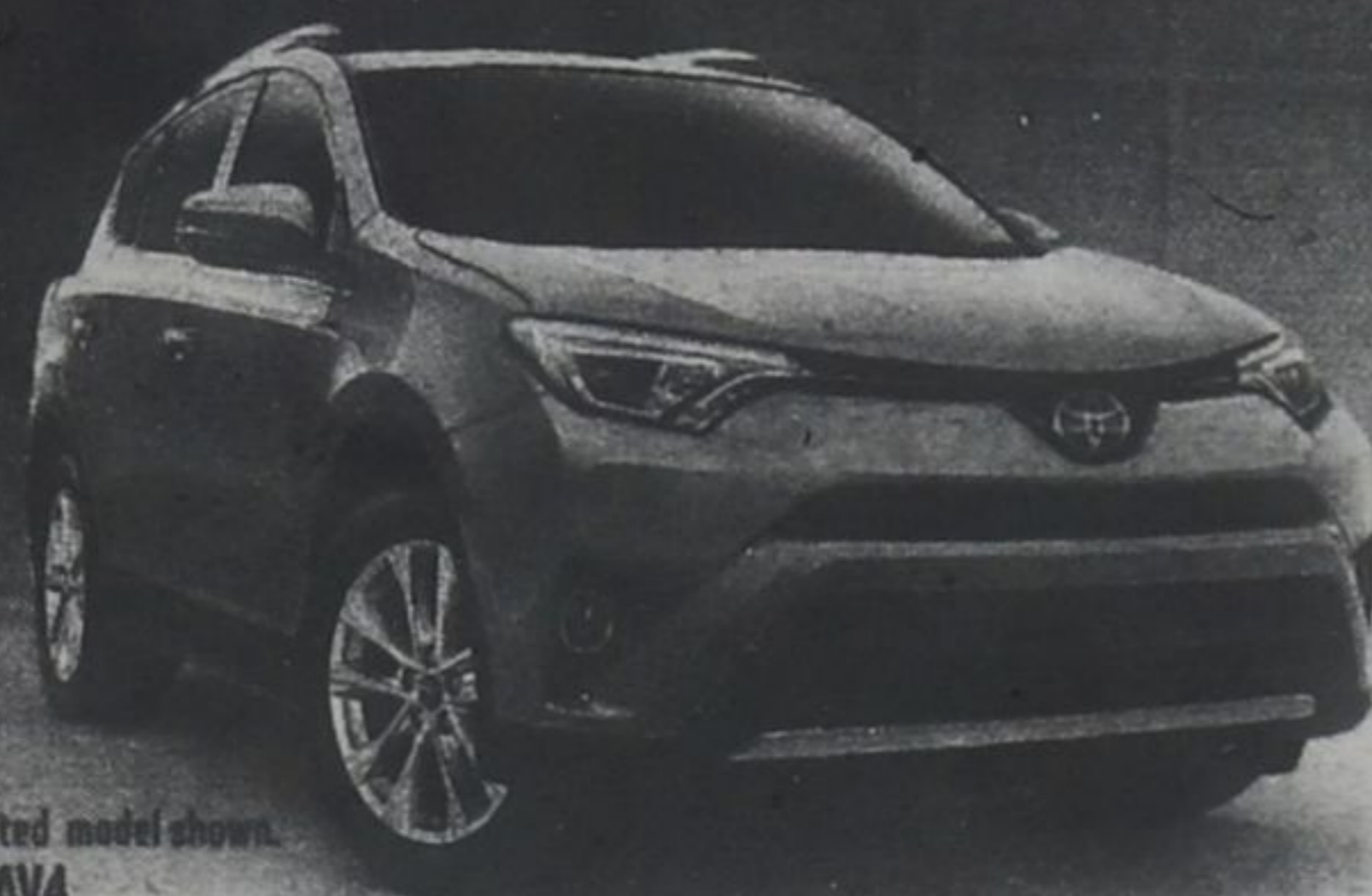
AWD Limited model shown. 2018 RAV4