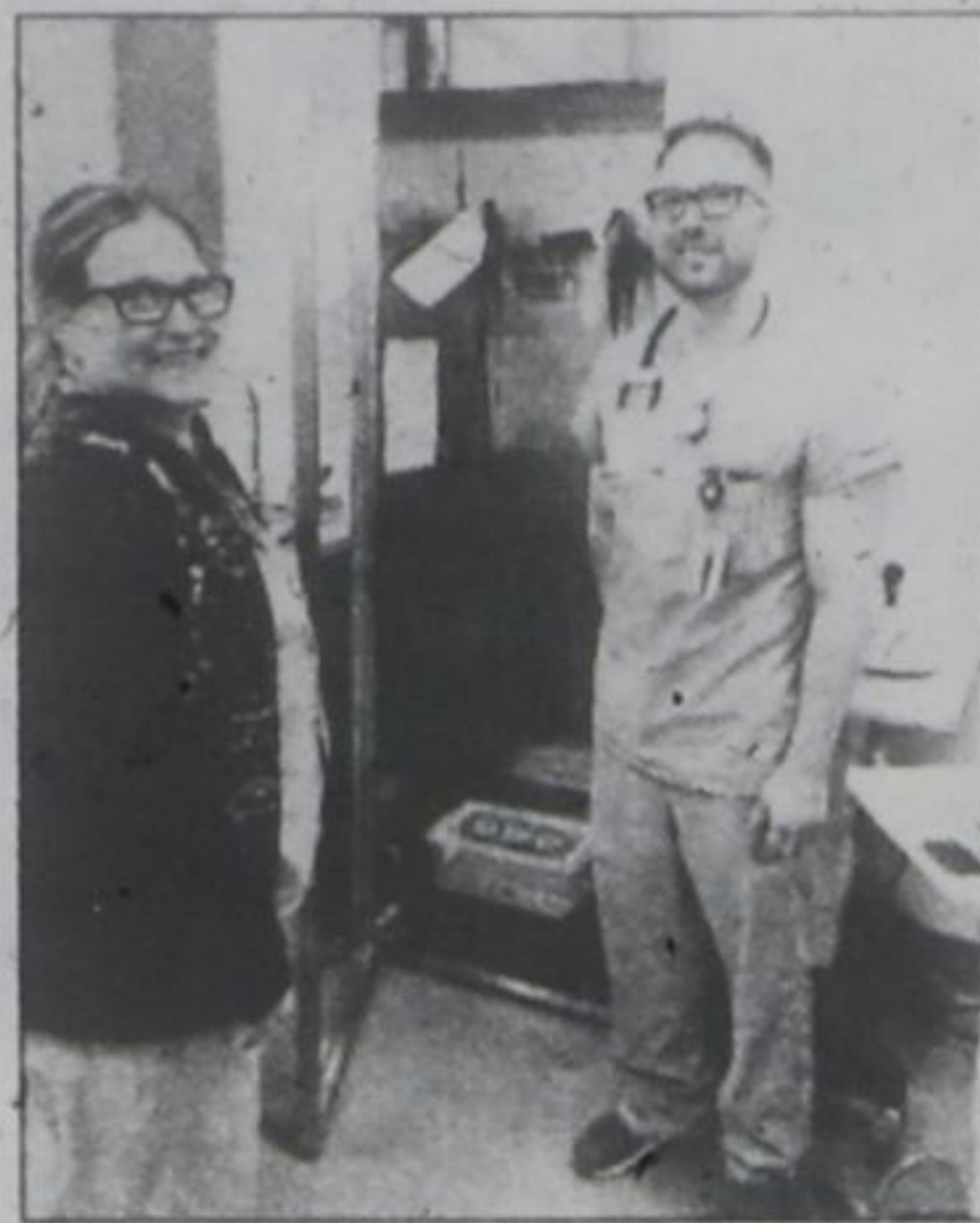
Milton District Hospital photo