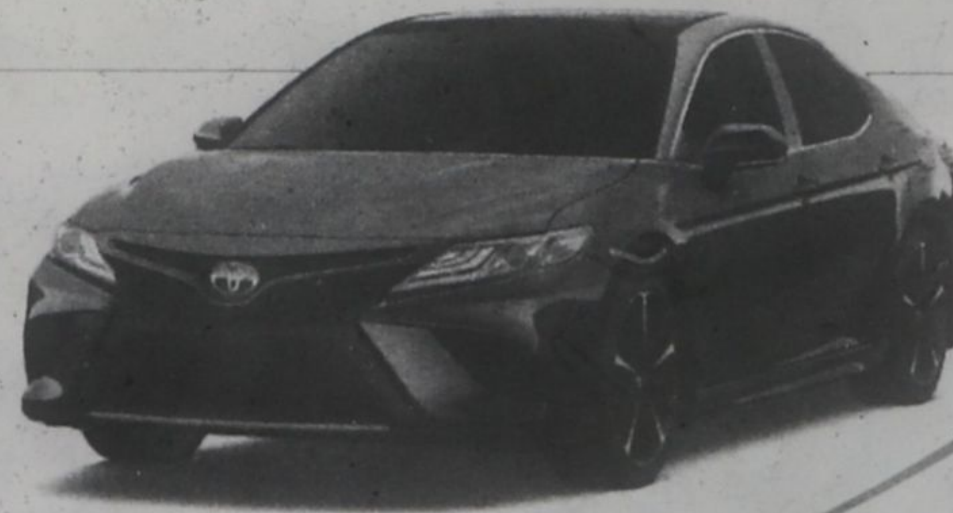
XSE V6 model shown. 2018 CAMRY

Weekly for 39 months with $1,000 Lease Assist* applied. Includes freight and fees. HST extra.