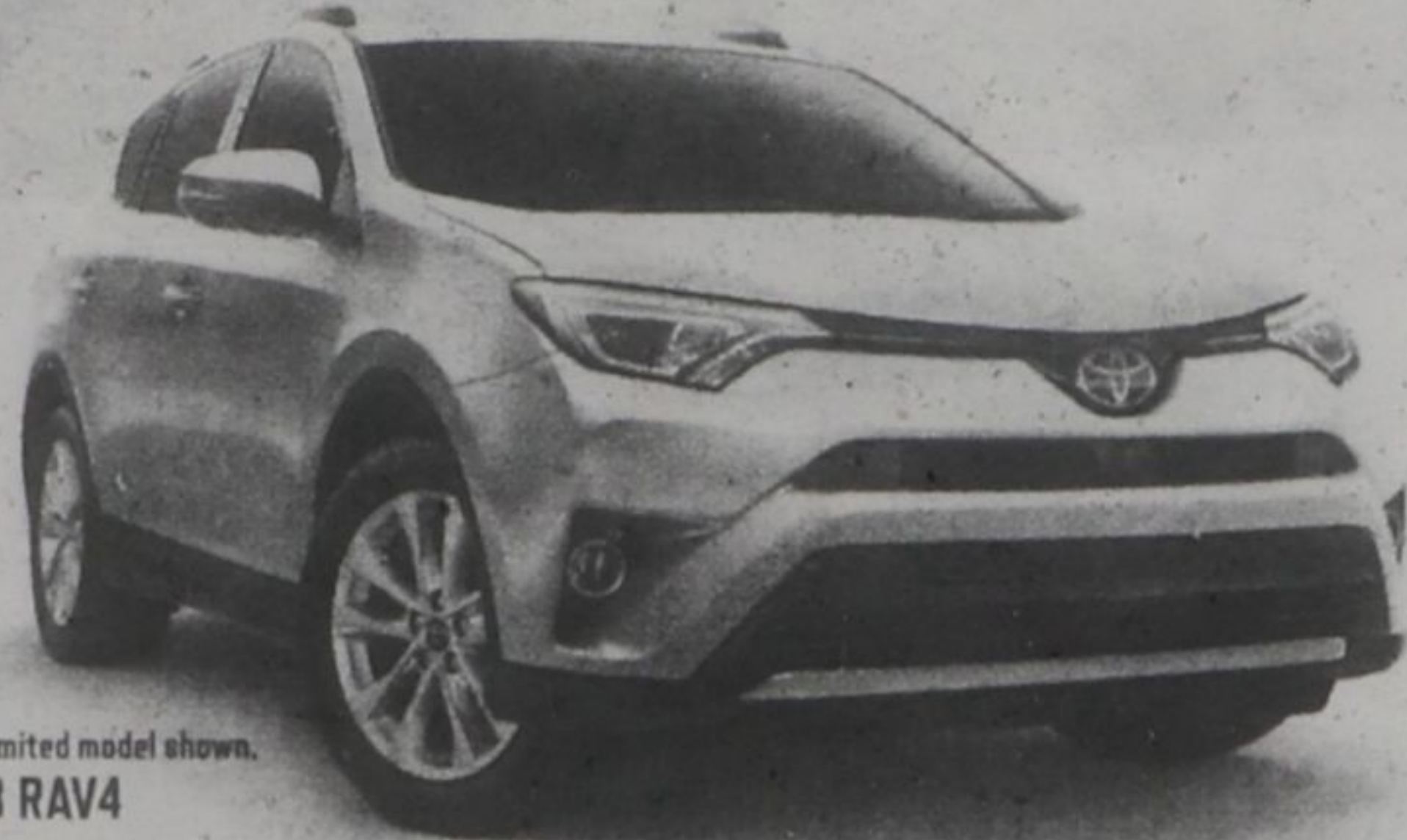
AWD Limited model shown. 2018 RAV4