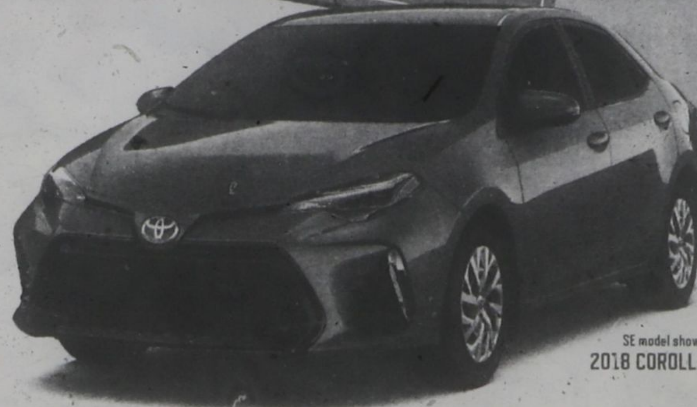
SE model shown. 2018 COROLLA

Weekly for 39 months with $1,250 Customer Incentive* applied. Includes freight and fees. HST extra.