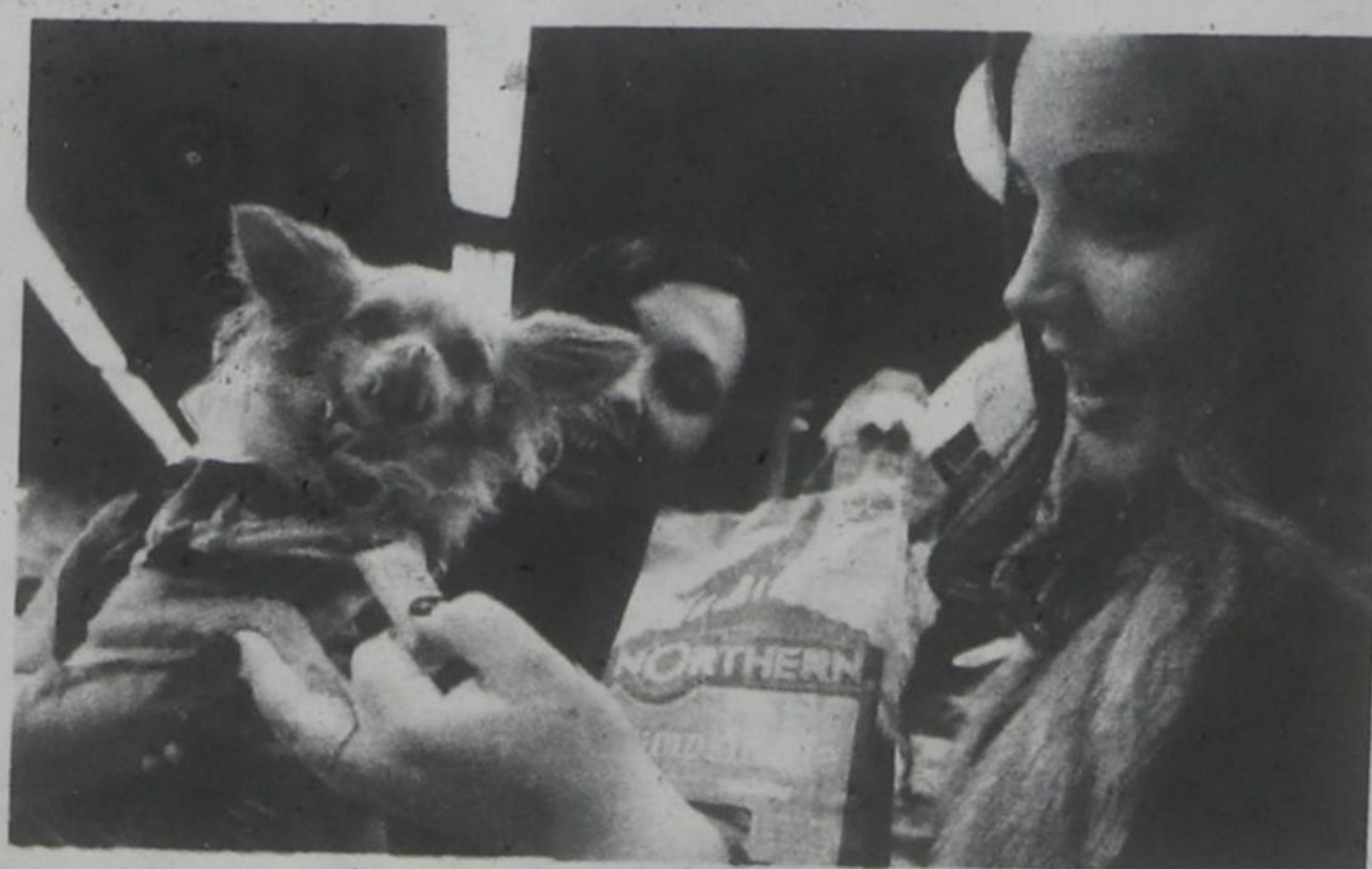
The Oakville and Milton Humane Society benefitted from PetValu's Halloween event.