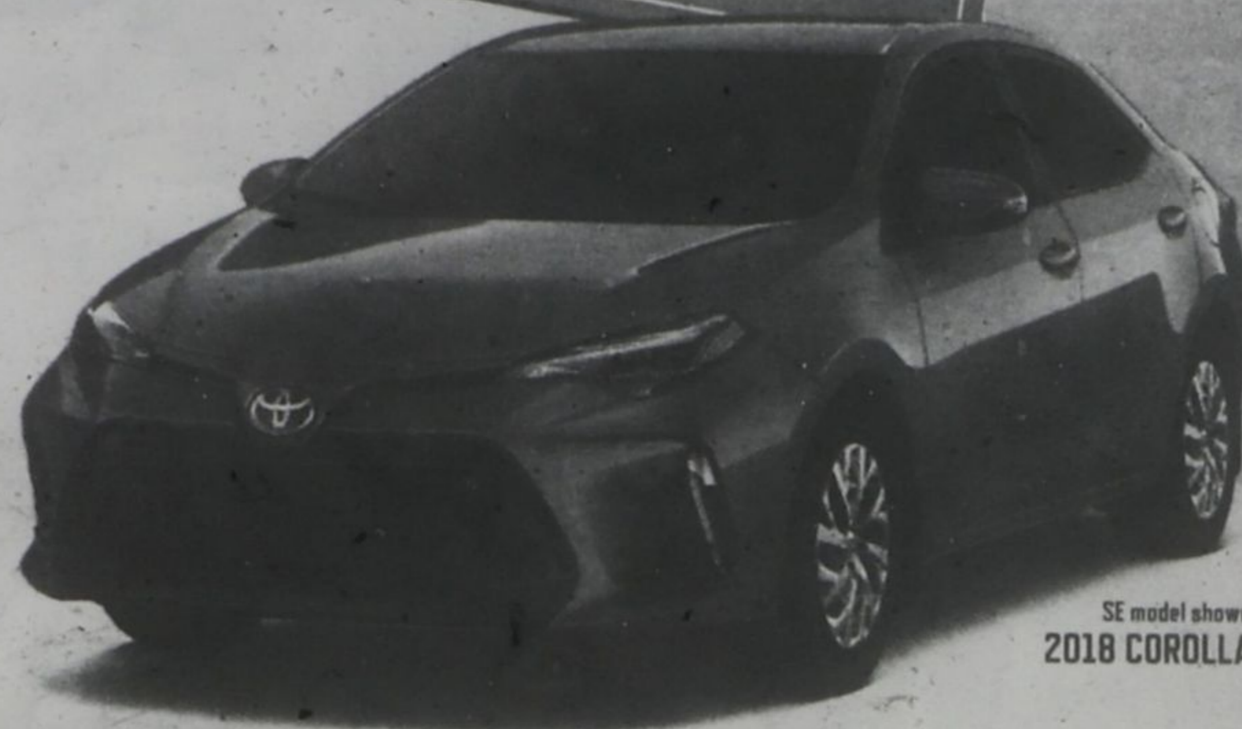
SE model shown. 2018 COROLLA

Weekly for 39 months with $1,250 Customer Incentive* applied. Includes freight and fees. HST extra.