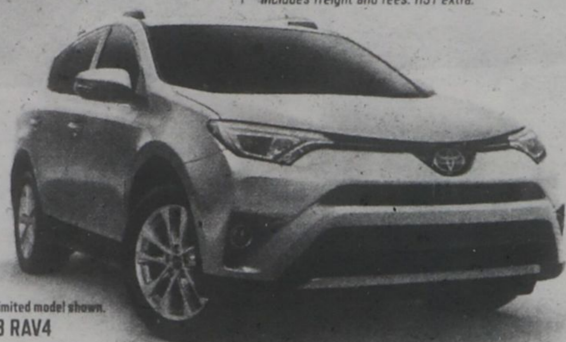
AWD Limited model shown. 2018 RAV4