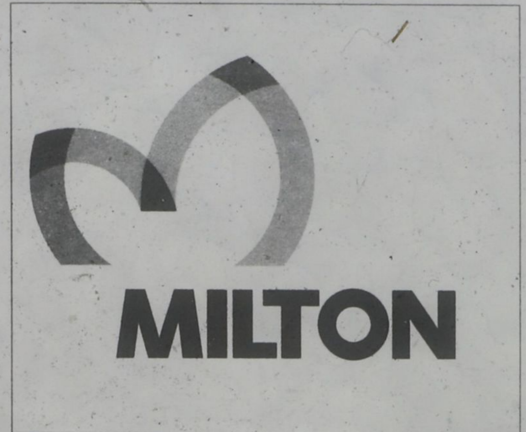
Town of Milton logo