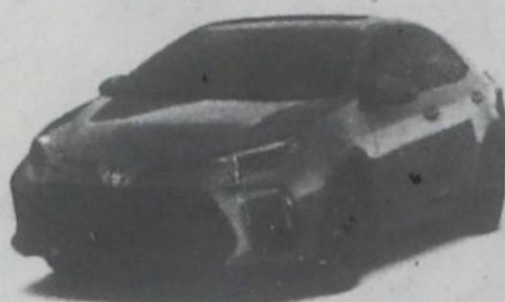
XSE model shown