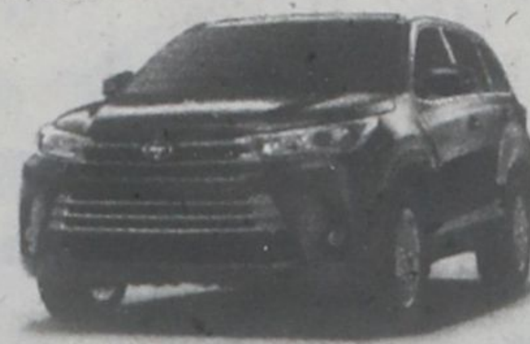
XLE AWD model shown