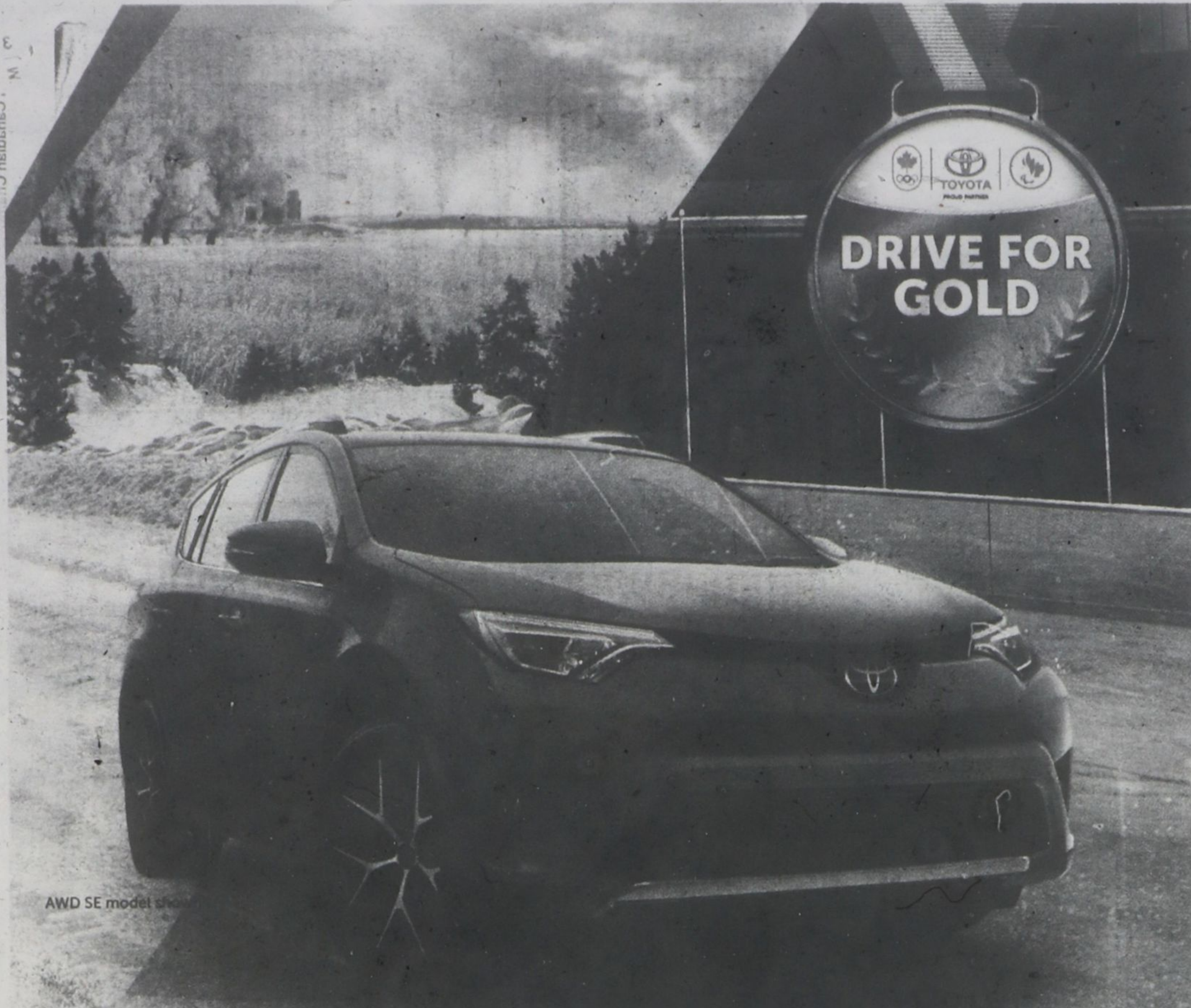
AWD SE model shown