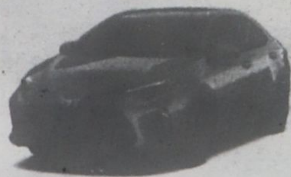
XSE model shown

2018 COROLLA CE ALL-IN LEASE FROM $39* FOR 39 MONTHS AT 0.49% APR WEEKLY WITH $1,850 DOWN $1,250 CUSTOMER INCENTIVE* APPLIED. INCLUDES FREIGHT AND FEES, HST EXTRA. Pre-Collision System with Pedestrian Detection Lane Departure Alert Backup Camera 6.1" Touchscreen Display Audio with Bluetooth® Capability