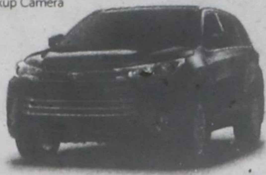
XLE AWD model shown

2018 HIGHLANDER FWD LE ALL-IN LEASE FROM $99* FOR 39 MONTHS AT 3.99% APR WEEKLY WITH $5,400 DOWN INCLUDES FREIGHT AND FEES, HST EXTRA. Pre-Collision System with Pedestrian Detection Automatic High Beam Lane Departure Alert Dynamic Radar Cruise Control 6.1" Touchscreen Display Audio System with Bluetooth®, Steering Wheel Control and SIRI Eyes Free Backup Camera