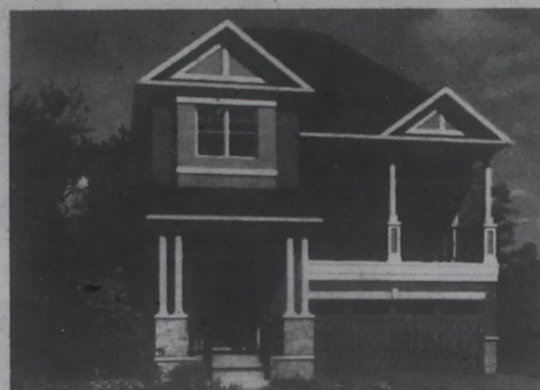
36' Detached Home, The Mackay 'Traditional', 2,371 Sq.Ft.