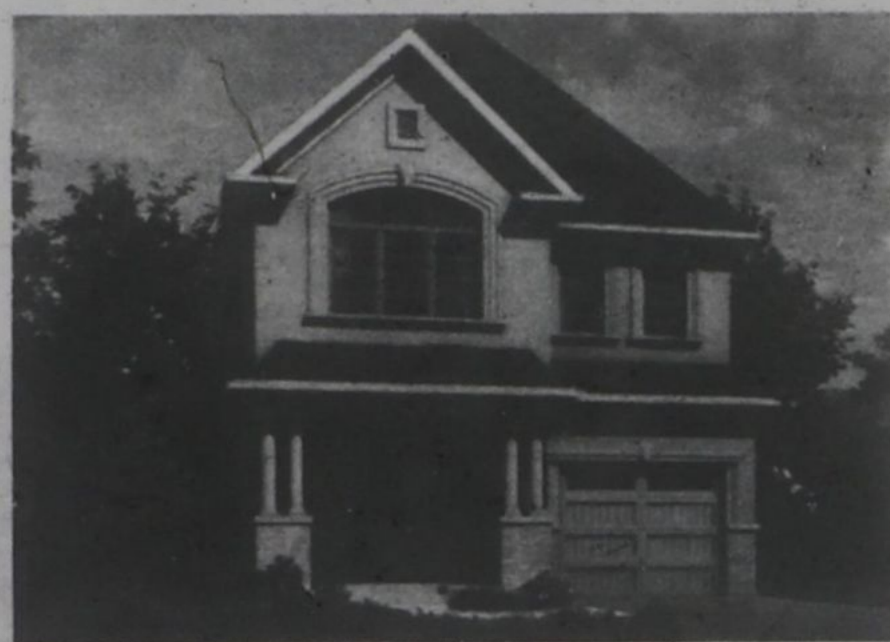
30' Detached Home, The Kapella 'French Chateau', 1,970 Sq.Ft.