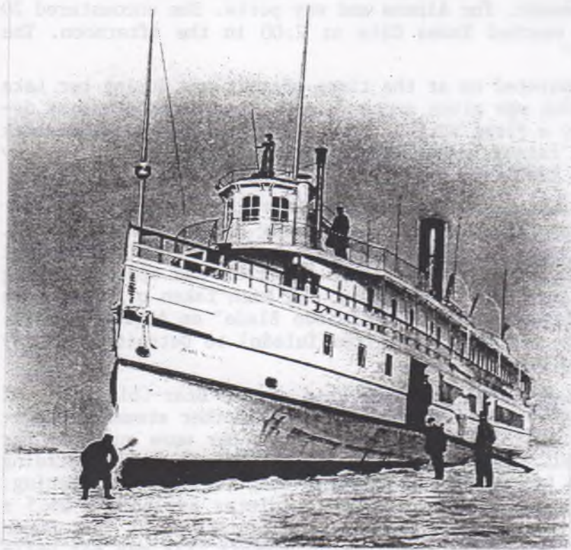
It is Christmas Day 1896 and ARUNDELL is frozen in solidly on Lake St. Clair.

years, ARUNDELL ran out of Detroit in the early and late parts of the season, but went to Lake Ontario for the Thousand Islands service in the "high season". The "British Whig" of August 22, 1898, noted: "Str. ARUNDELL - Fast Day Line - Rochester, Oswego, Kingston and Alexandria Bay. Steamer leaves Swift's wharf (Kingston) on Tuesdays, Thursdays and Saturdays at 10 a.m. for Oswego and Charlotte. Leaves Mondays, Wednesdays and Fridays at 6 p.m. for Thousand Islands and Alexandria Bay. Making direct connections at Oswego for New York..."