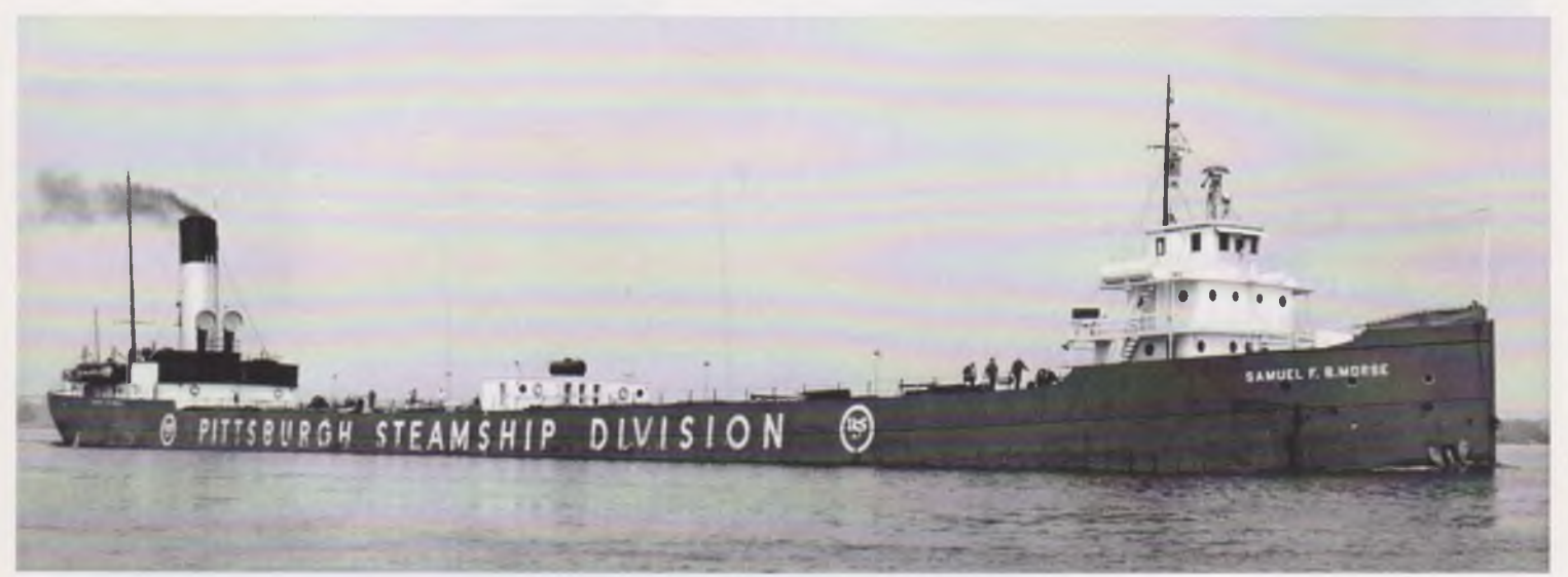
The Bascom camera again caught the MORSE, this time in Little Rapids Cut, on June 19, 1953, in her last year of service. The "billboard" has changed.