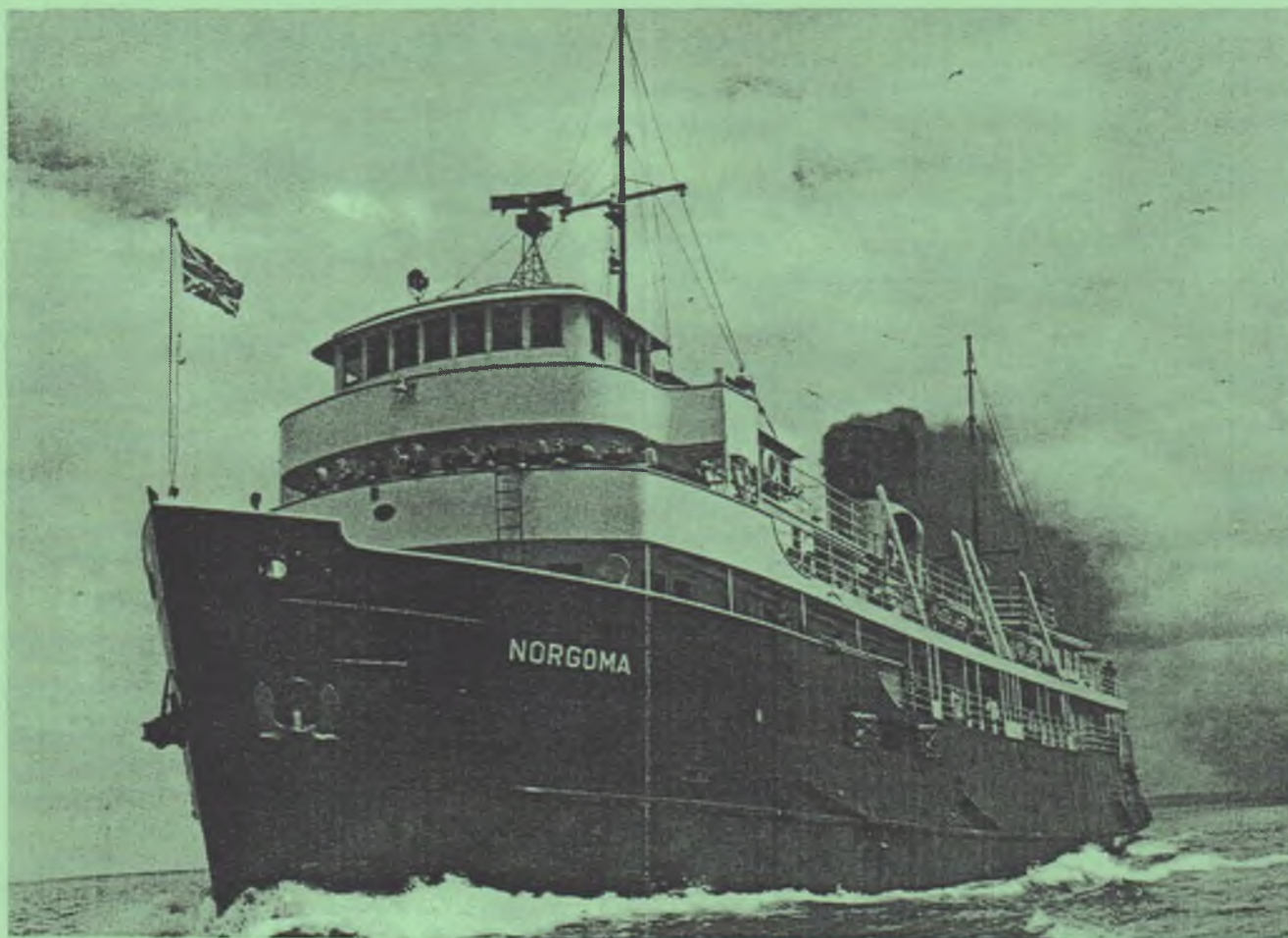
S.S. "NORGOMA" BUILT 1950 — COMPLETELY MODERN