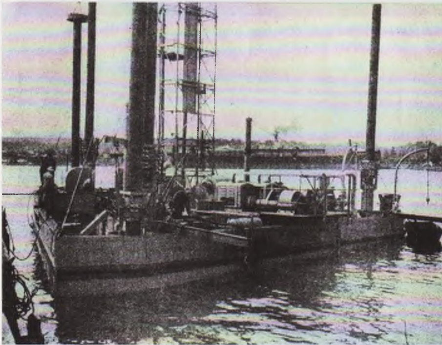
shows TRANSLAKE NO. 3 shortly before her departure on her ill-fated first and only voyage.