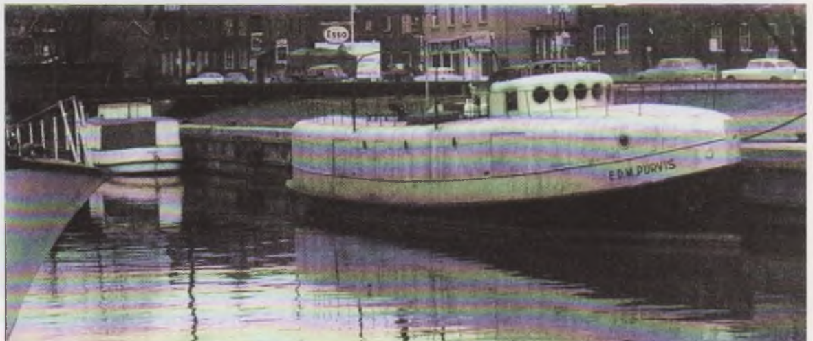
This is the fishtug E. D. M. PURVIS as seen at Owen Sound in November of 1959.