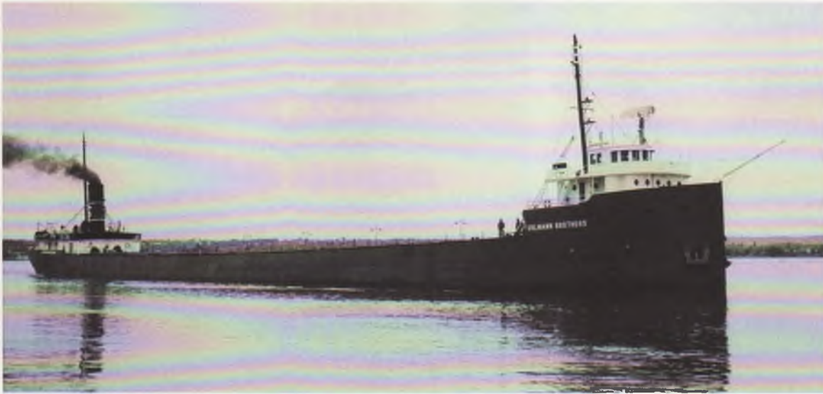
shows UHLMANN BROTHERS (i) downbound at Little Rapids on October 10, 1965.