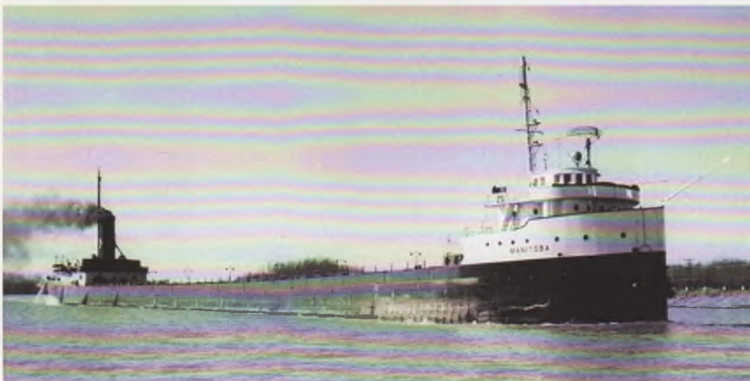
MANITOBA is downbound at Port Robinson in this November 19, 1966, photo by the Editor.