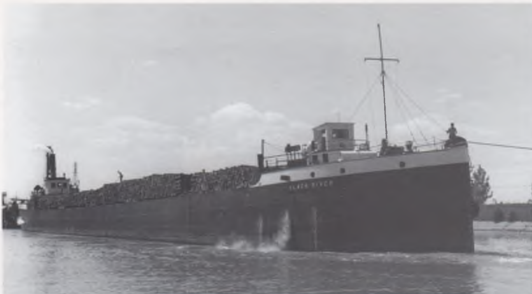
BLACK RIVER is seen downbound at Allanburg on August 11, 1950, in another photo by Jim Kidd.