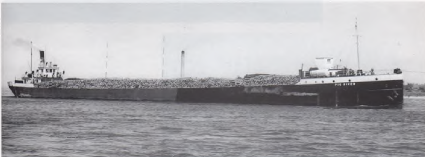
caught PIC RIVER downbound at the Huron Cut.