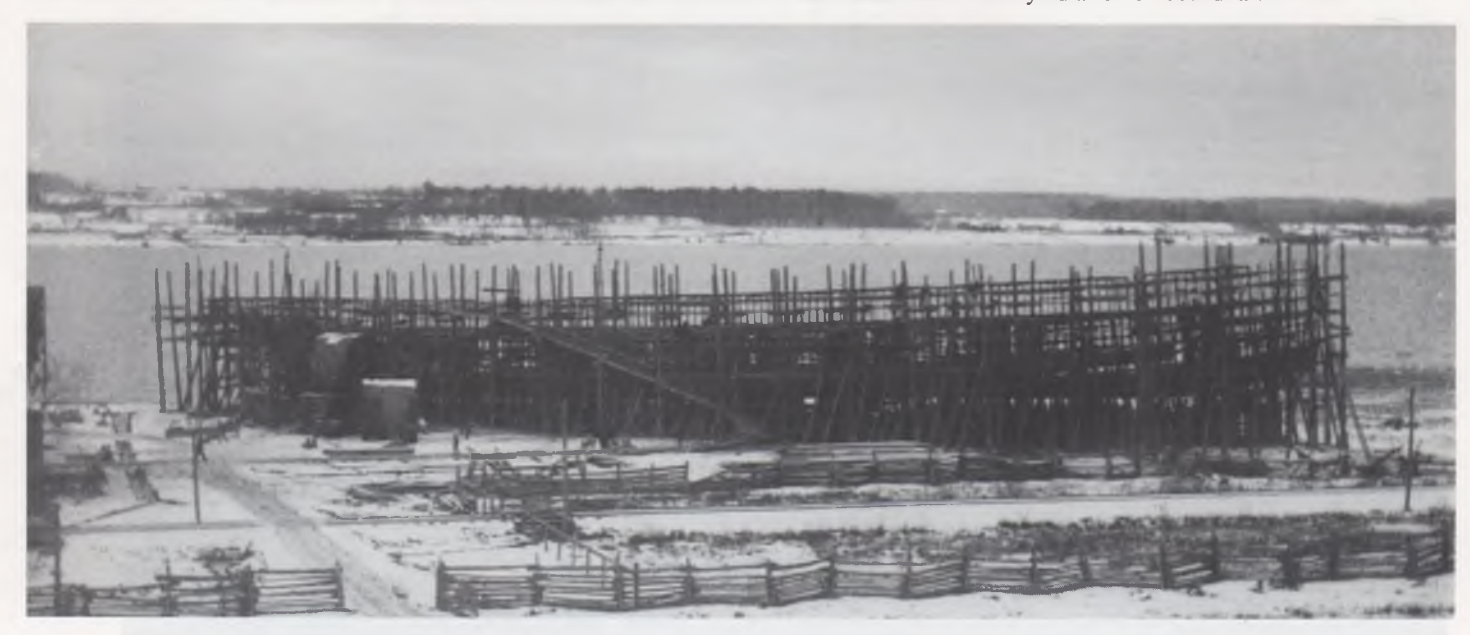
Photo from the National Archives of Canada shows MANITOBA "in frame" at the Polson Iron Works yard at Owen Sound late in 1888.