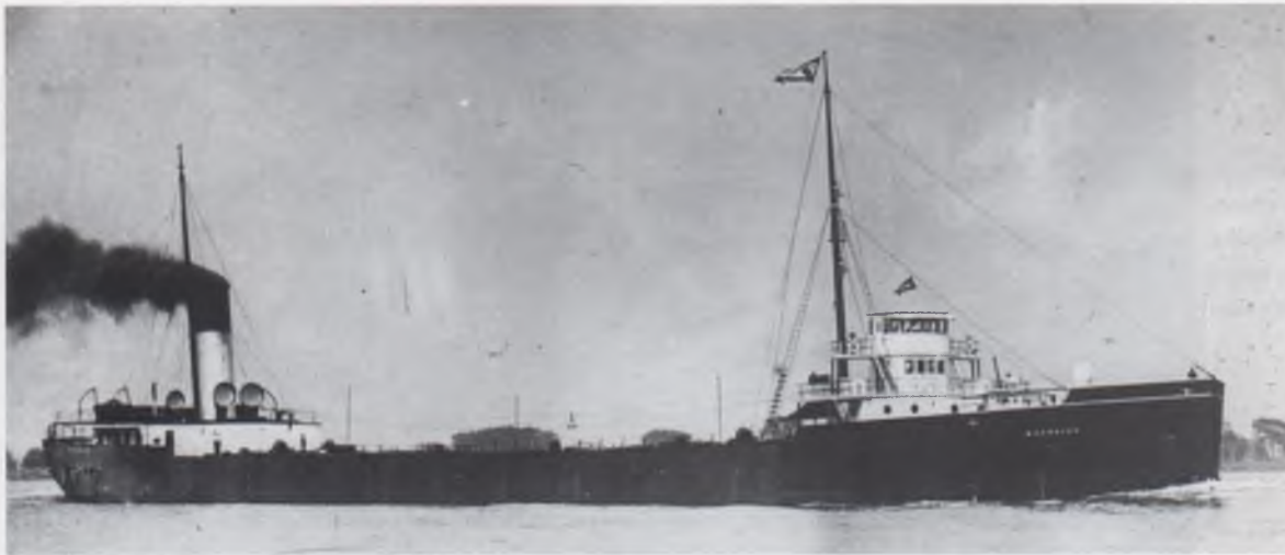
caught MAUNALOA down- bound in the St. Clair River off Marine City in the World War One era.