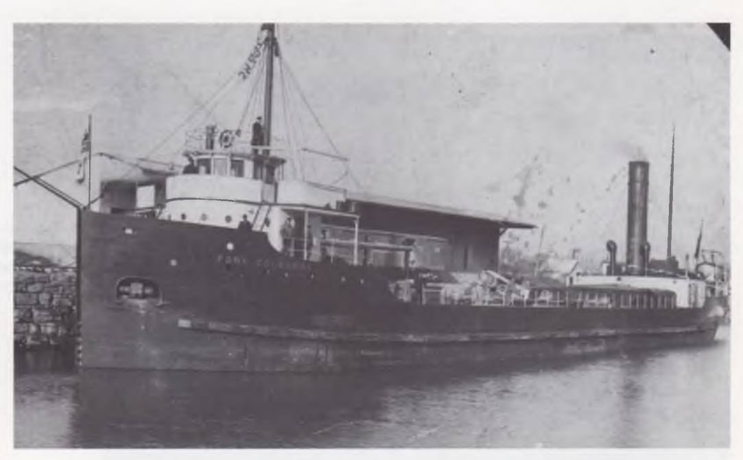
More photographed was PORT DALHOUSIE's fleetmate PORT COLBORNE.