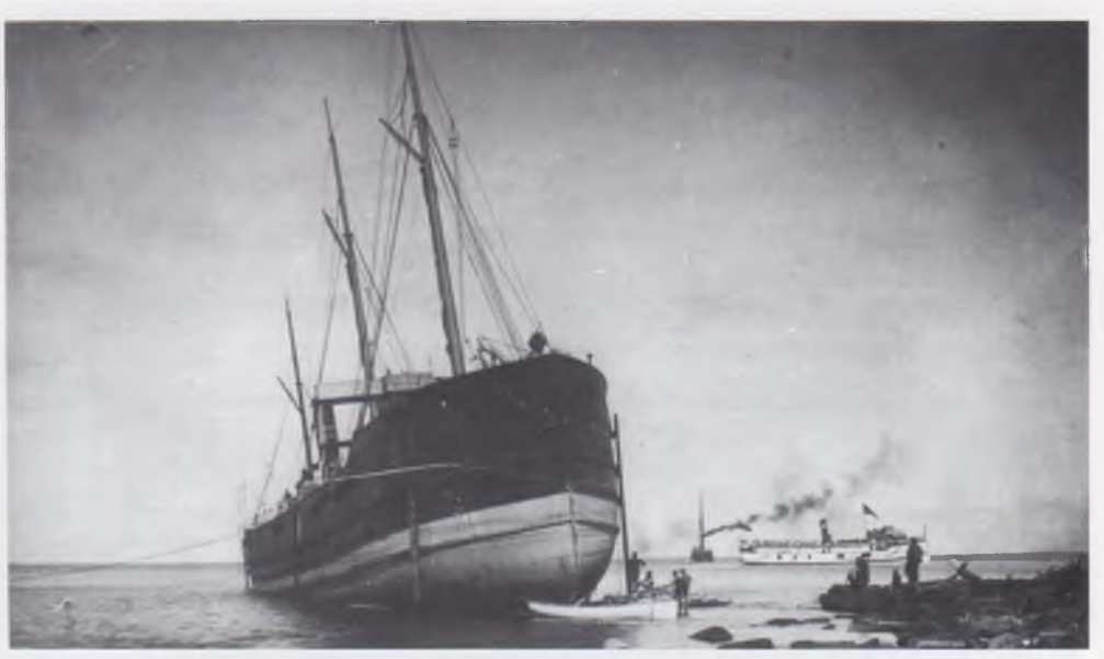
It is July of 1893, and ROSEDALE is ashore at Knife River, Minnesota. Visible at right, her decks crowded with excursionists, is OSSIFRAGE.