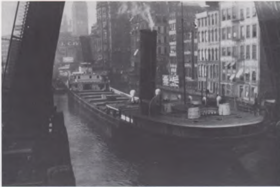
MAJOR, in her Mitchell years, is seen at Chicago, being escorted up the river and through the bridges by tugs.