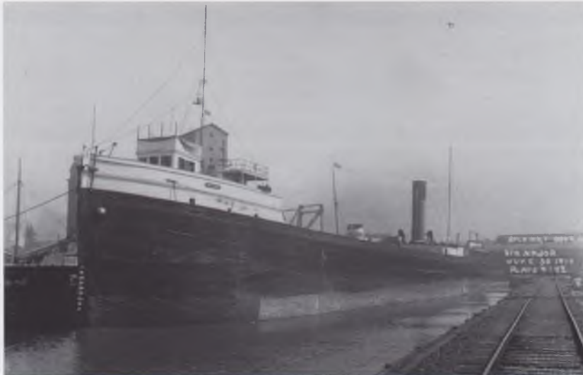
It is June 30, 1917, and Playfair's MAJOR is in the drydock at Buffalo.