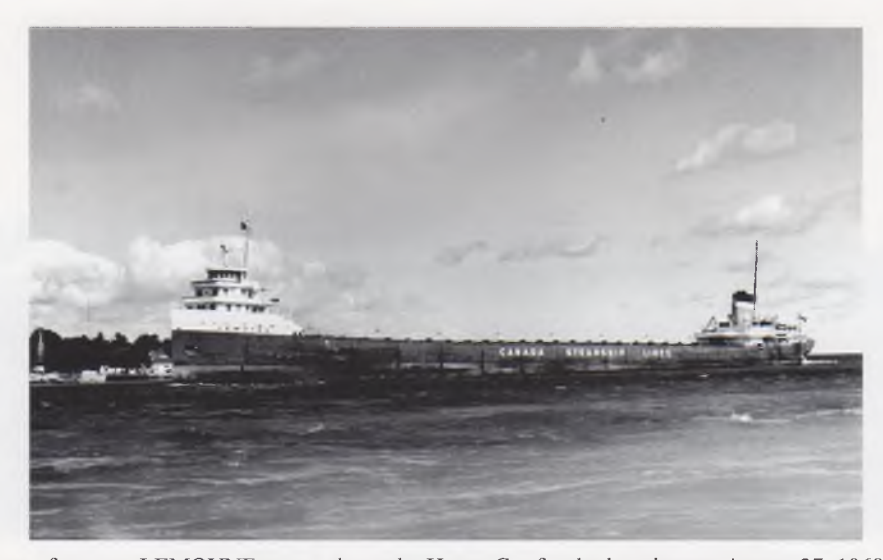
Looking much the worse for wear, LEMOYNE passes down the Huron Cut for the last time on August 27, 1968.