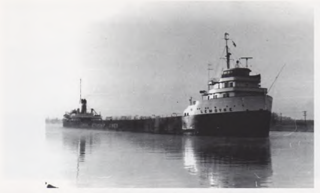
The early morning sun caught LEMOYNE in the Welland Canal for "Scotty" McCannell's camera on November 19, 1996.