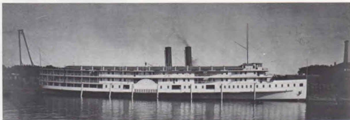
MONTREAL nears completion at Sorel. There is still much to be done on her but steam has been raised in her boilers.