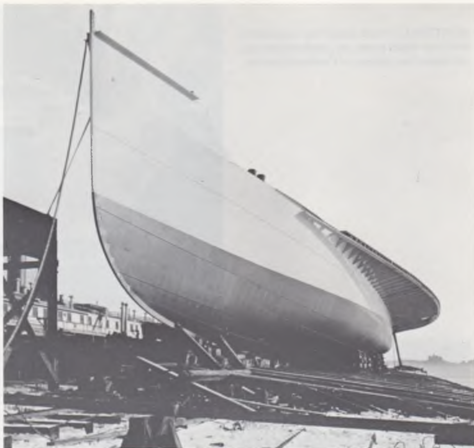
This is MONTREAL on the Bertram ways just before her launch. At extreme left is KINGSTON, not yet completed.