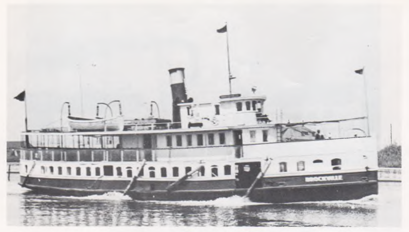
\ensuremath{\mathtt{J.H.}} Bascom photographed BROCKVILLE inbound at the Toronto Western Gap in 1931.