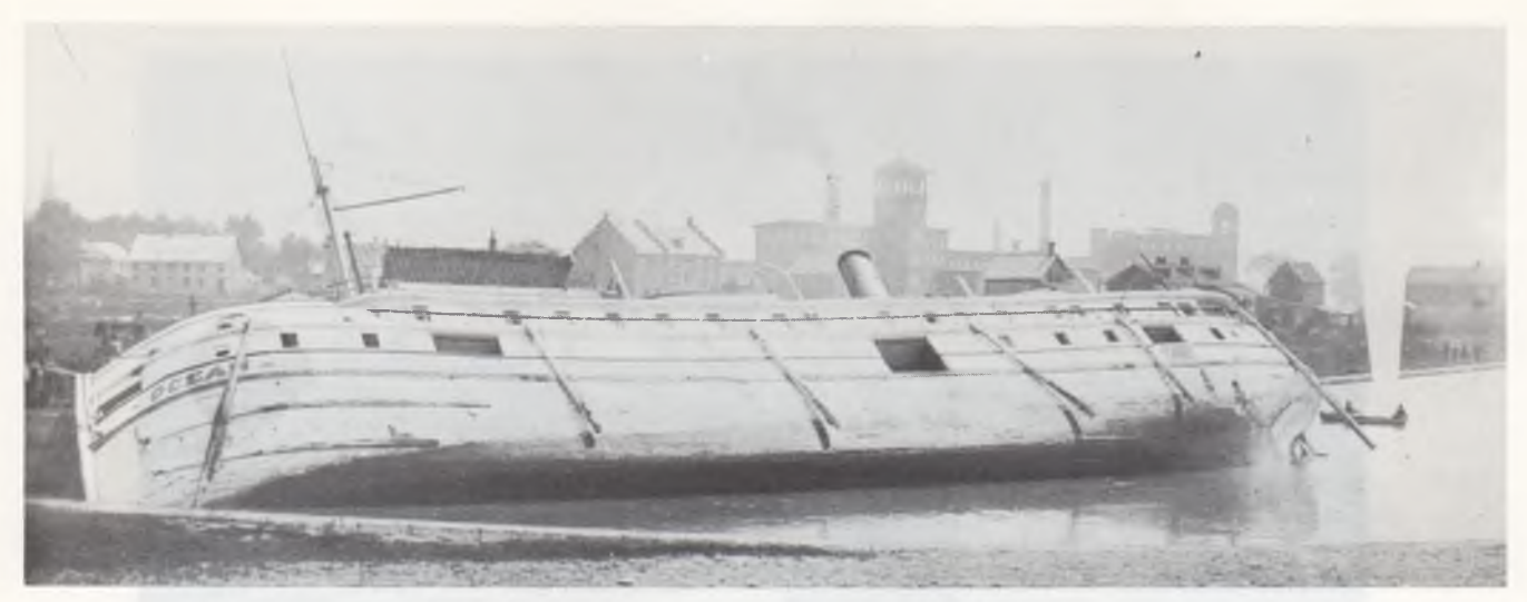
OCEAN looked like this after her June 19, 1895, accident with the gates at Lock 17 in the Cornwall Canal.