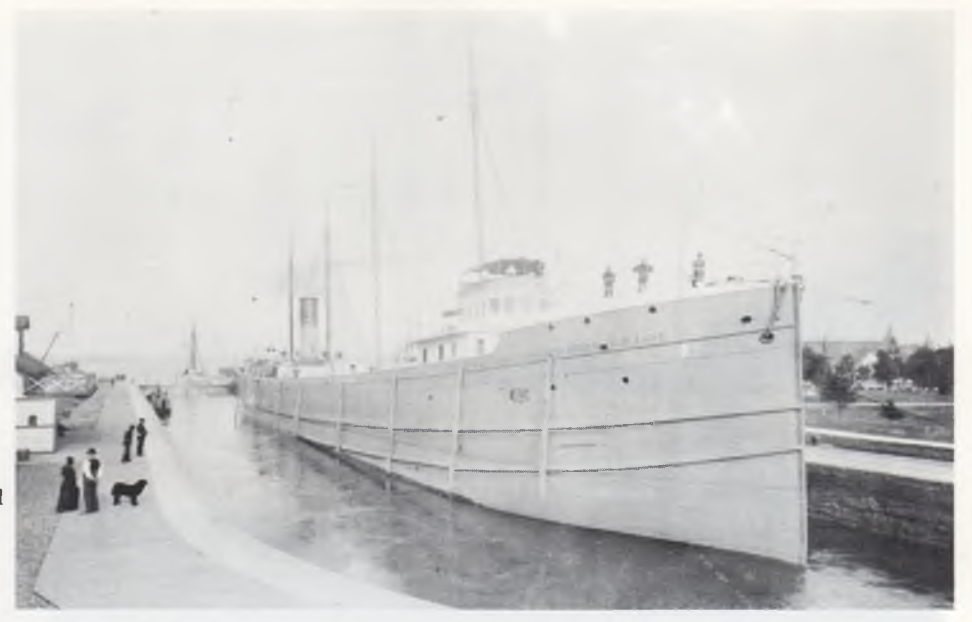
EMILY P. WEED was in Western Transit colours when photographed in the Weitzel Lock at the Soo in 1894.