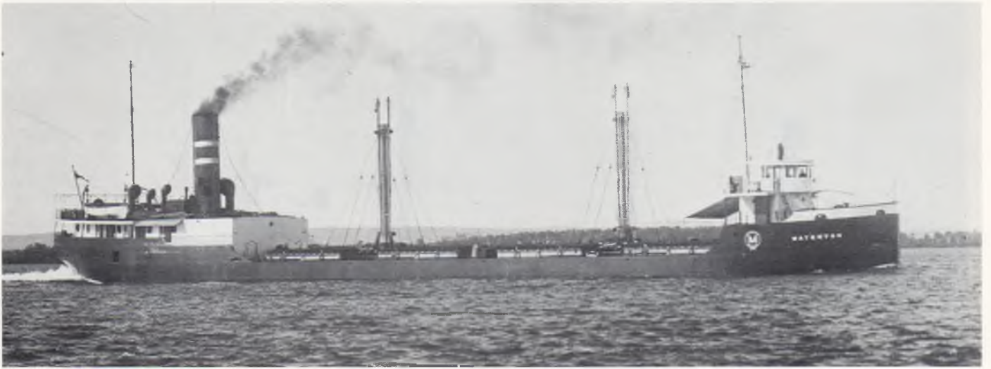
Young photo dated 1929 shows WATERTON downbound in Little Rapids Cut.