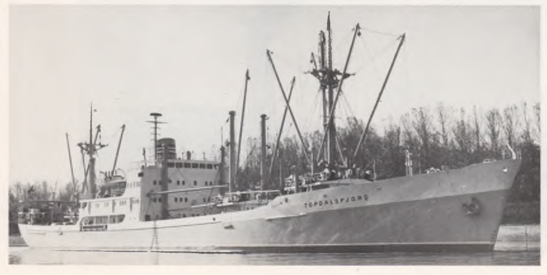
The ship that sank CEDAR-VILLE, the Norwegian TOP-DALSFJORD, was photographed outbound at Port Weller by J. H. Bascom on October 22, 1960.